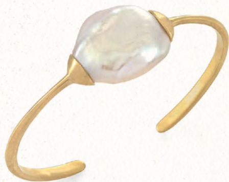
LANGIT BAROQUE CUFF GOLD DIP