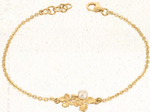
FLORA NIRWANA BRACELET WITH PEARL GOLD DIP