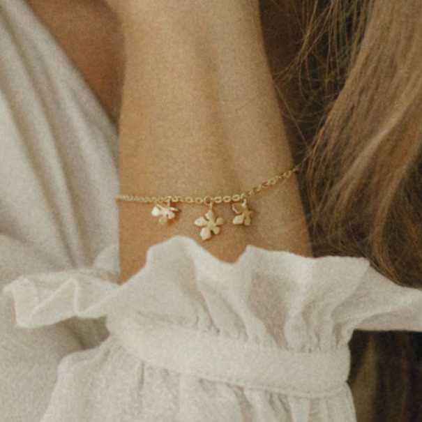
FLORA NIRWANA BRACELET WITH DANGLE GOLD DIP