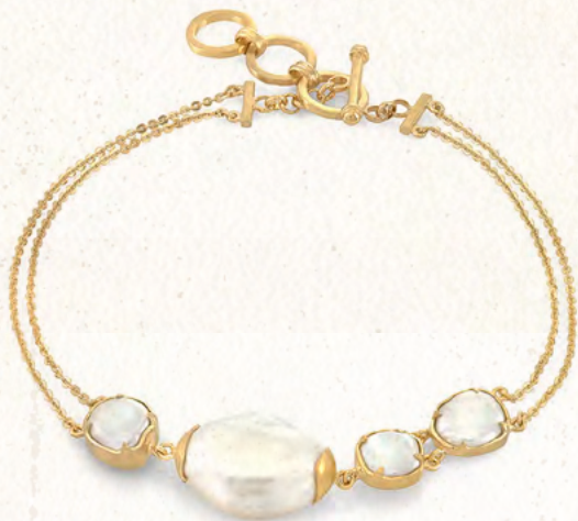
LANGIT BAROQUE CHOKER GOLD DIP