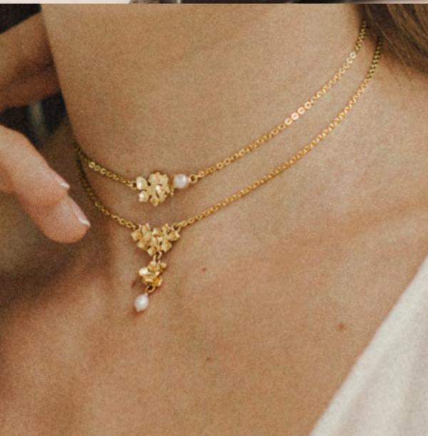
FLORA NIRWANA NECKLACE WITH PEARL GOLD DIP