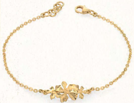
FLORA NIRWANA BRACELET GOLD DIP