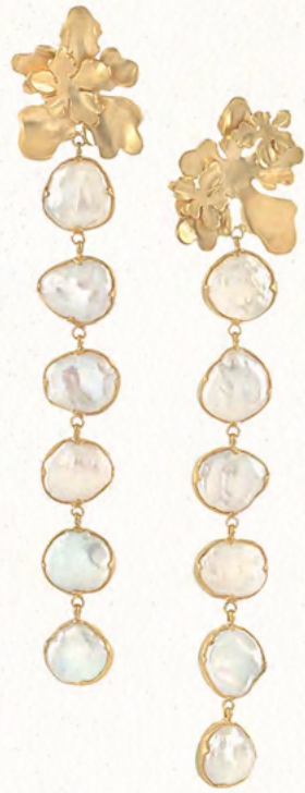
WANASARI CASCADE BAROQUE EARRINGS GOLD DIP