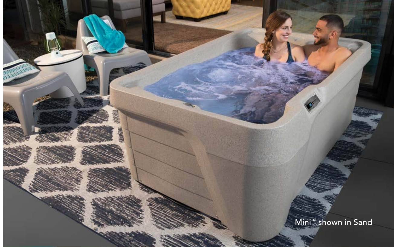
Mini™ shown in Sand