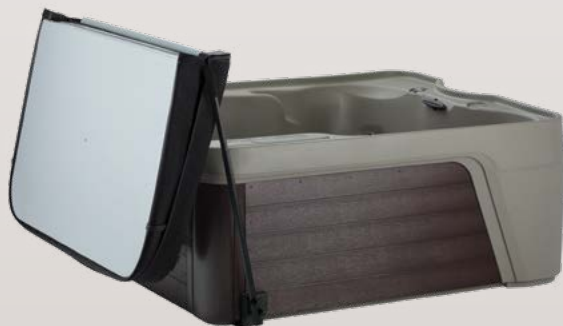
Azure™ Premier shown with Taupe shell, Brown cabinet, and Low Mount cover lifter