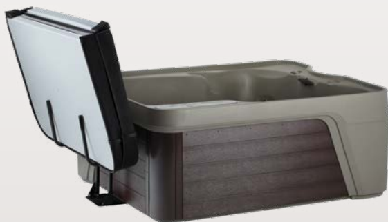
Azure™ Premier shown with Taupe shell, Brown cabinet, and Rx cover lifter.