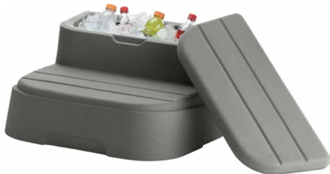
Shown in Taupe

Pairs With: Premier Series: Azure™, Excursion®, Monterey™; Sport Series: Azure™, Cascina®, Excursion®, Mini™, Monterey™, Tristar™