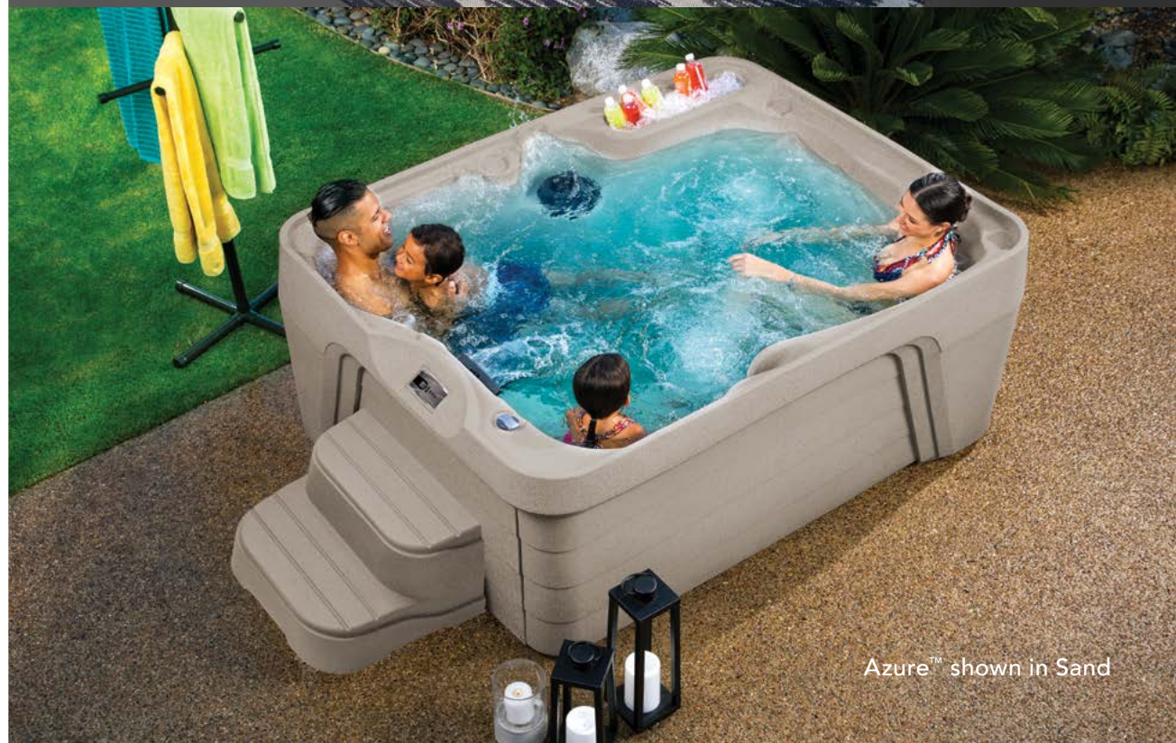
Azure™ shown in Sand