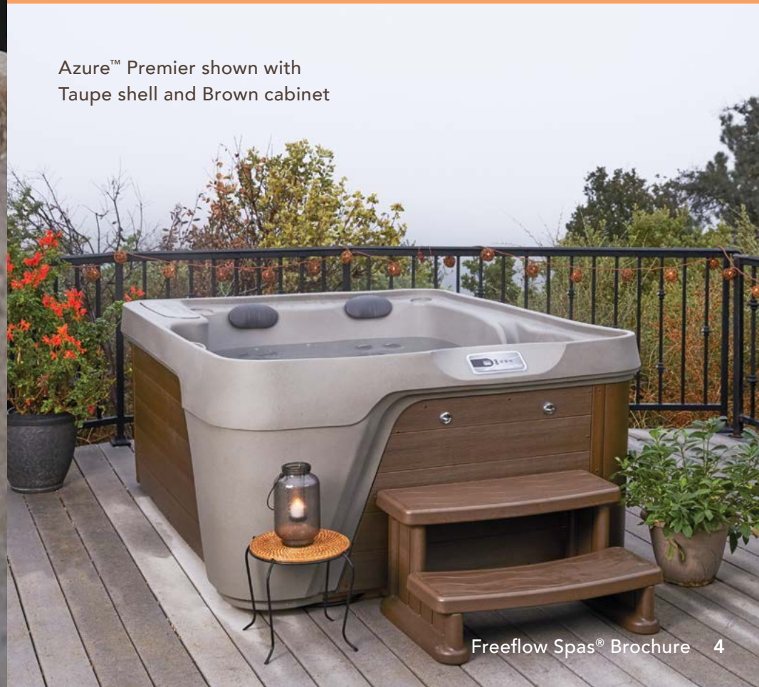
Azure™ Premier shown with Taupe shell and Brown cabinet