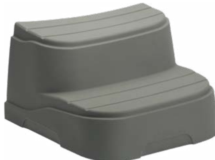
Shown in Taupe