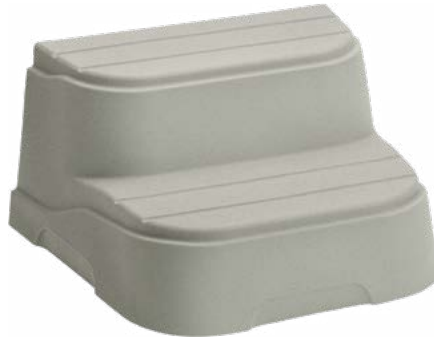
Shown in Sand