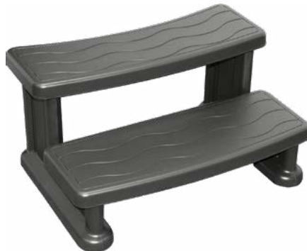
Shown in Charcoal