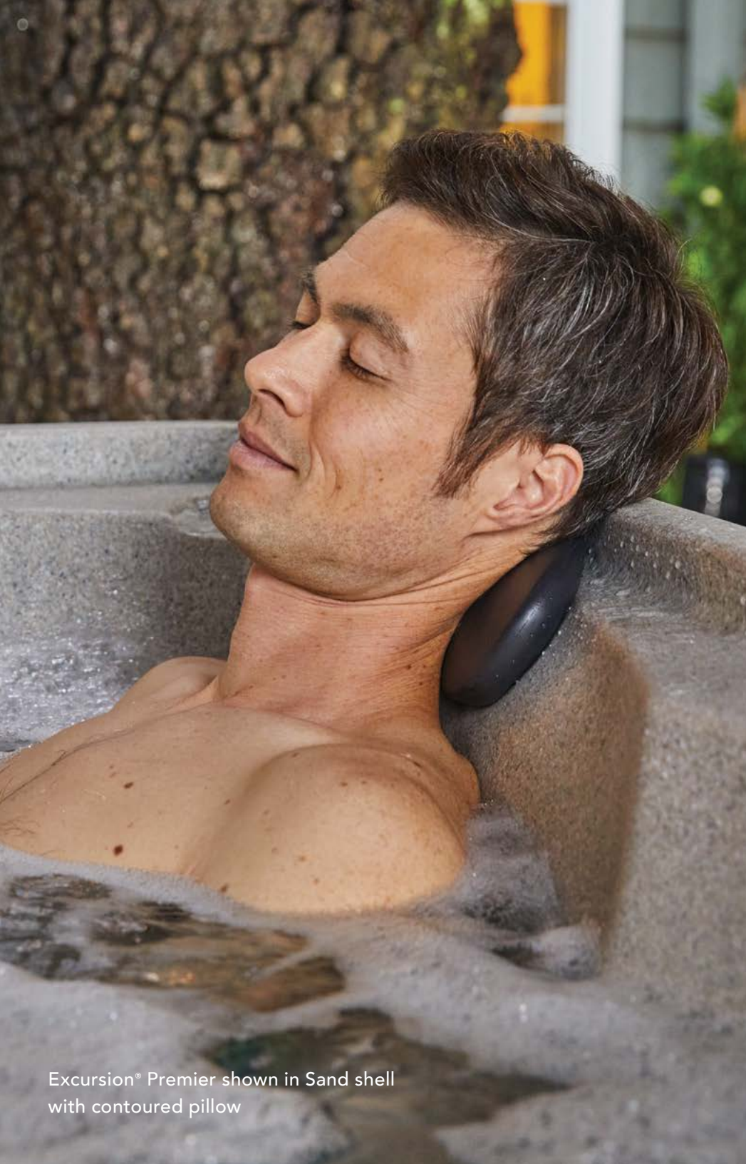
Excursion® Premier shown in Sand shell with contoured pillow