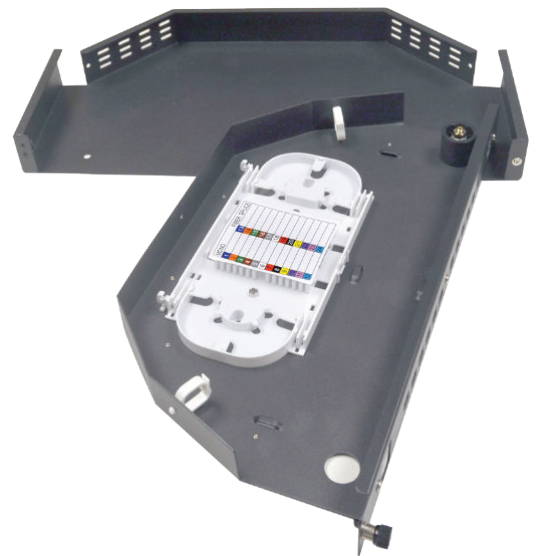
1RU Swing Tray Enclosure Right Side Hinged