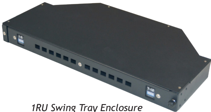
1RU Swing Tray Enclosure