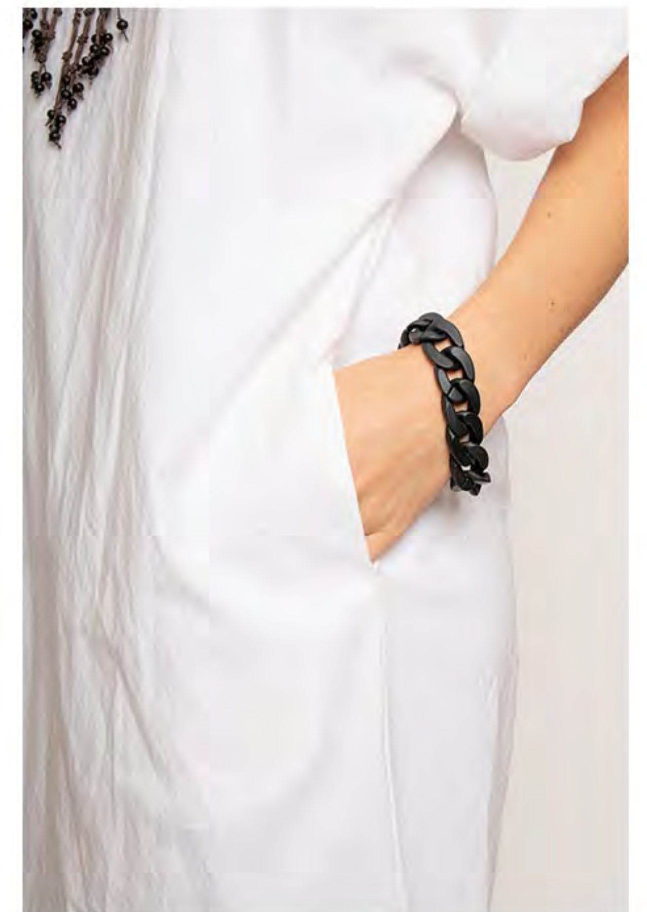
Style: Break The Chain bracelet Colors: Matte Black or Glossy Black Wholesale: $27 RRP: $55