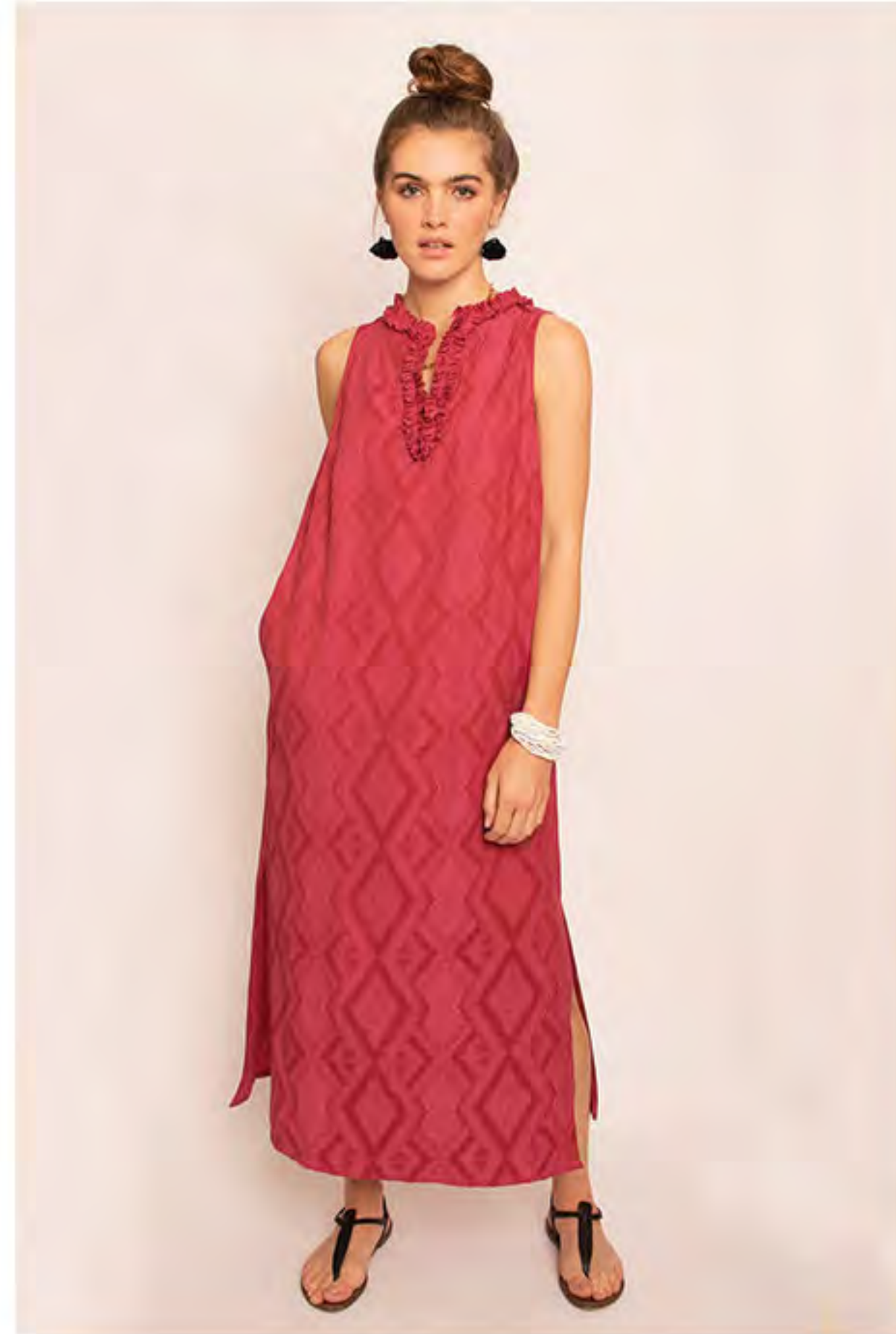
Style: Gilbert dress Color: Bougainvillea Fabric: reclaimed rayon Sizes: XS S M L Wholesale: $132 RRP: $265