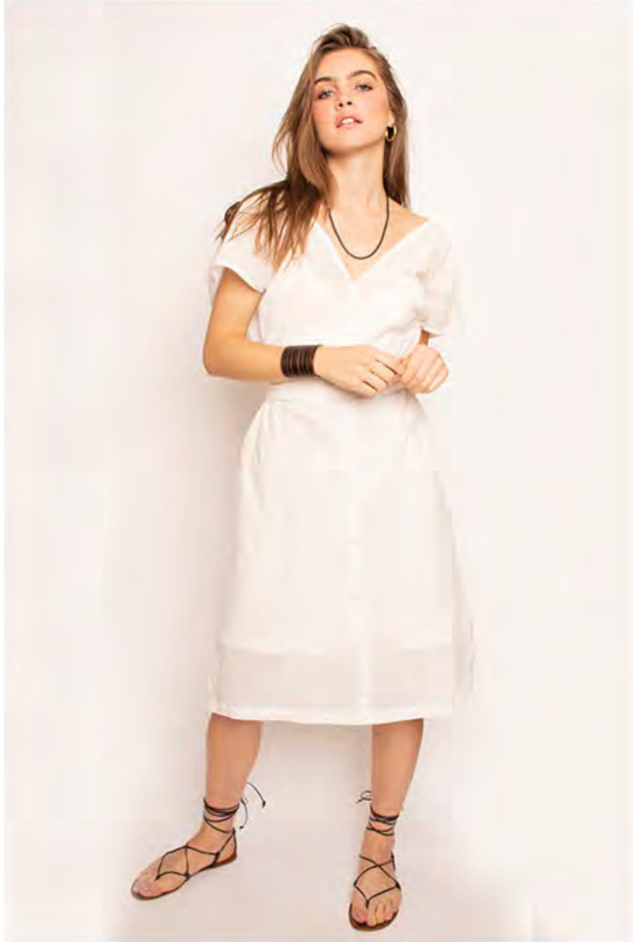
Style: Dalton dress Comes with sash Color: Cloud Fabric: sheer cotton gauze Sizes: O/S Wholesale: $132 RRP: $265