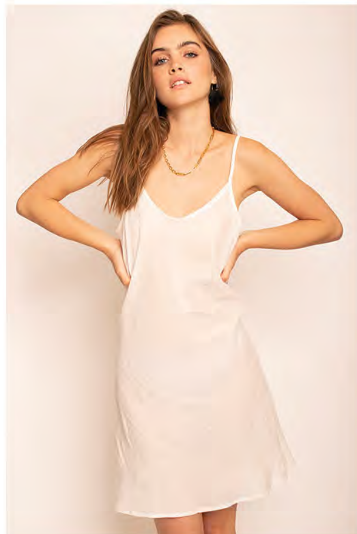
Style: Kaye slip Color: Cloud Fabric: cotton gauze Sizes: XS/S M/L Wholesale: $47 RRP: $95