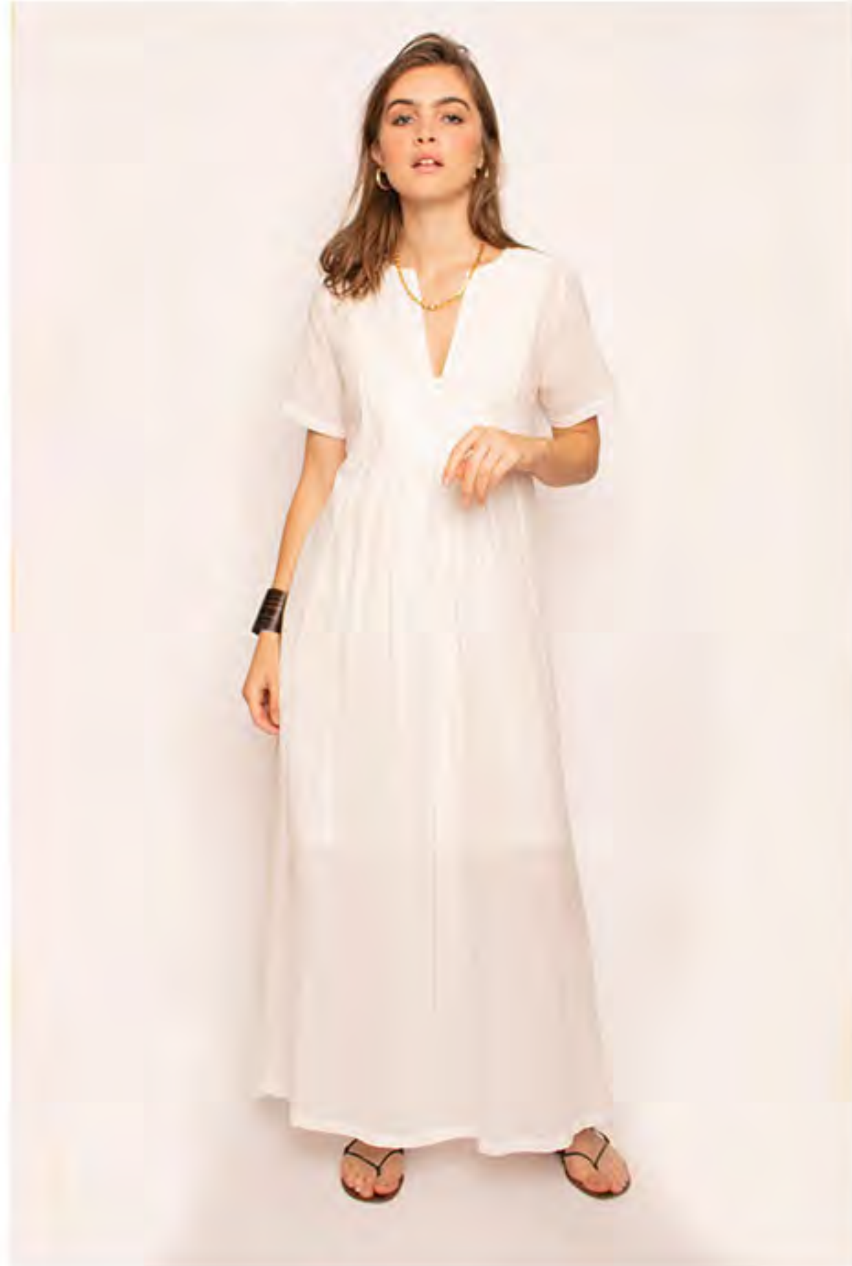
Style: McCall dress Color: Cloud Fabric: sheer cotton gauze Sizes: S M L Wholesale: $182 RRP: $365