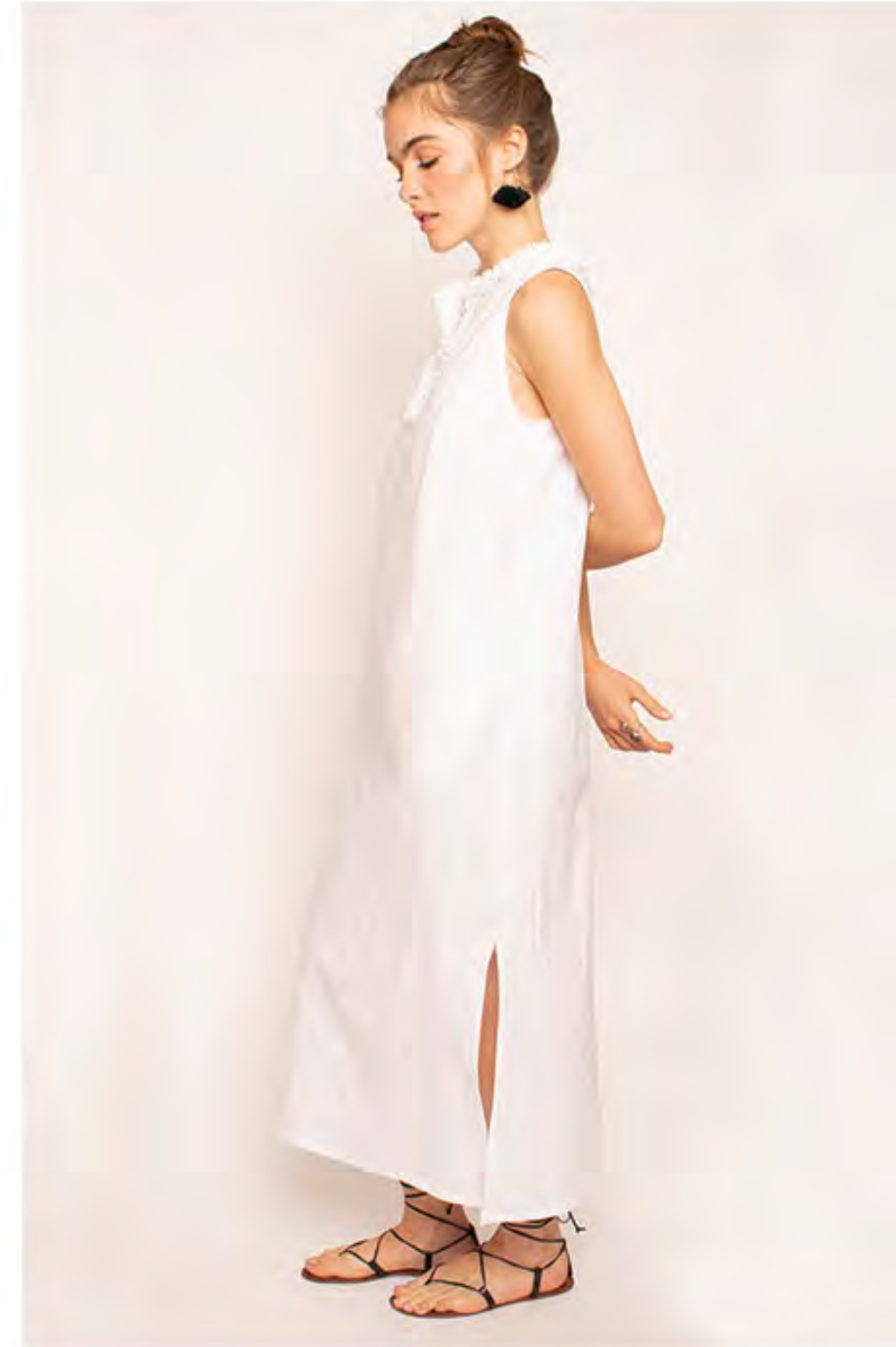
Style: Gilbert dress Color: Ghost Fabric: organic cotton Sizes: XS S M L Wholesale: $132 RRP: $265