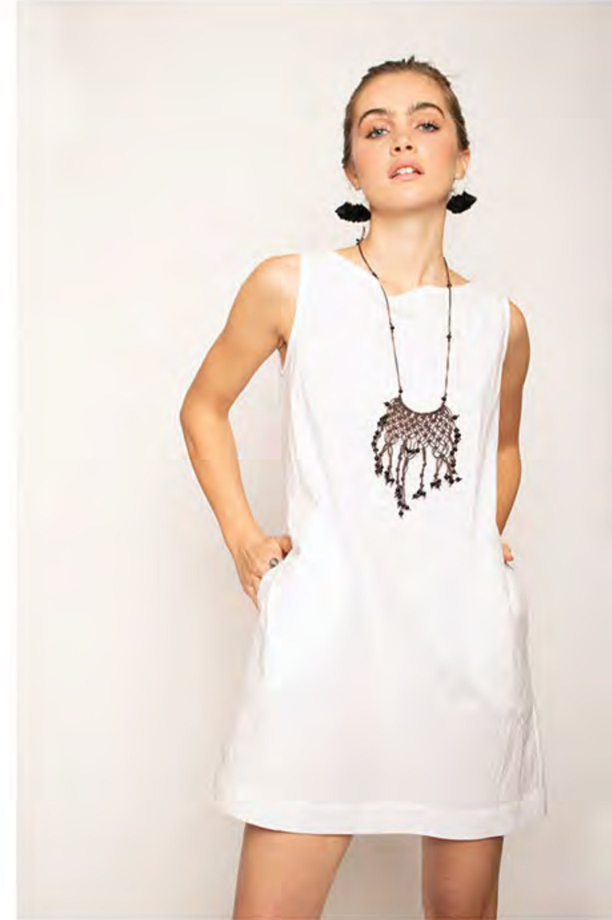
Style: Foster dress Color: Ghost Fabric: organic cotton Sizes: XS S M L Wholesale: $97 RRP: $195