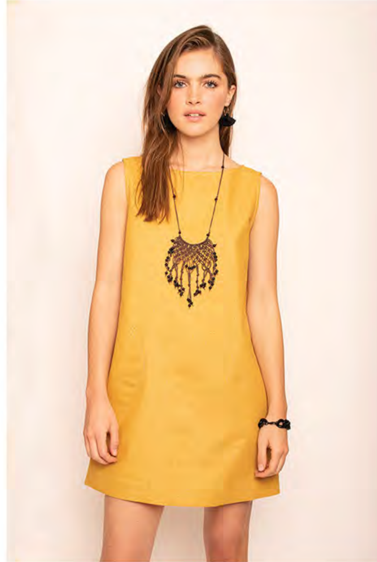
Style: Foster dress Color: Vermeil Fabric: organic cotton Sizes: XS S M L Wholesale: $97 RRP: $195