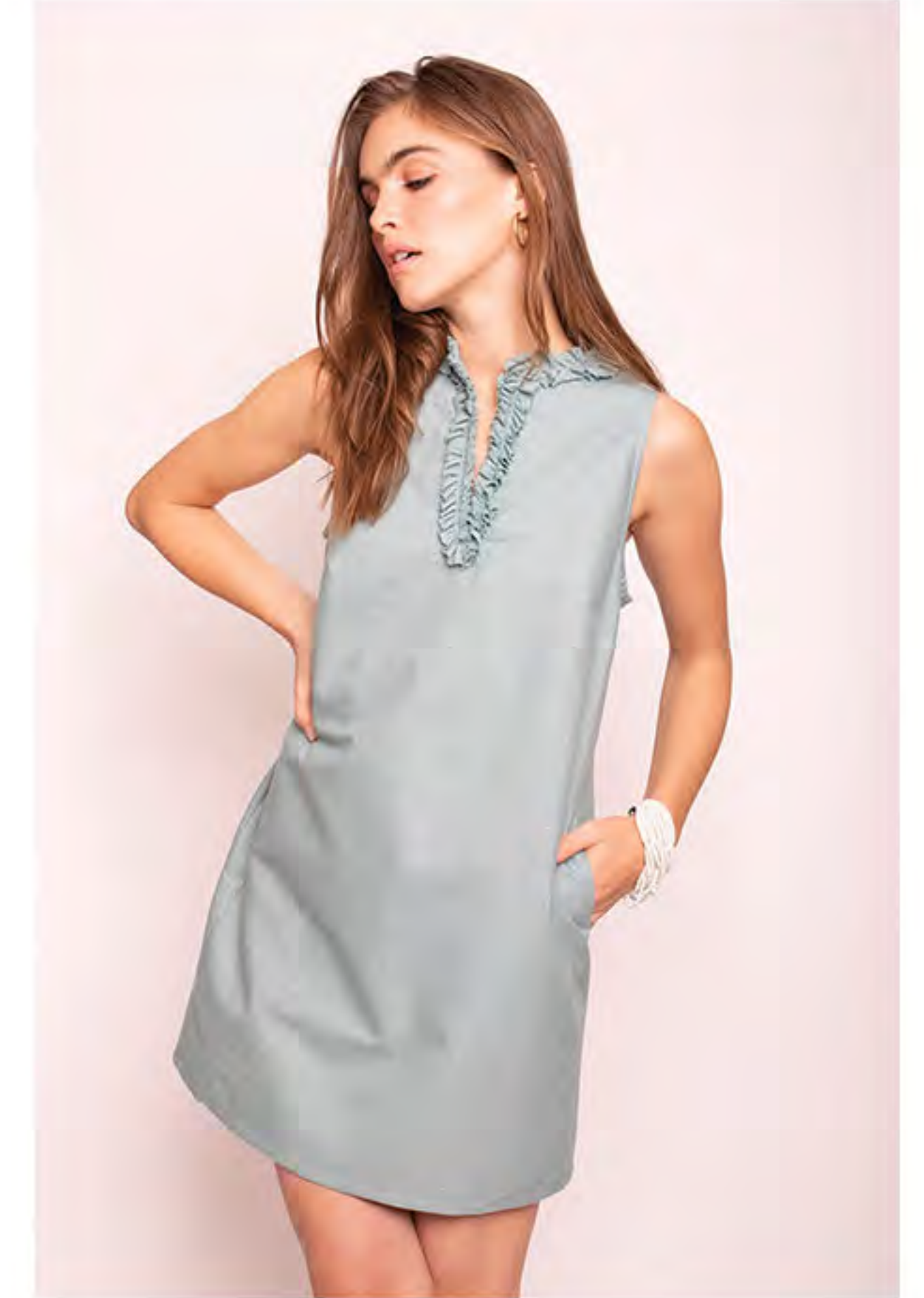
Style: Parker dress Color: Celestite Fabric: organic cotton Sizes: XS S M L Wholesale: $112 RRP: $225