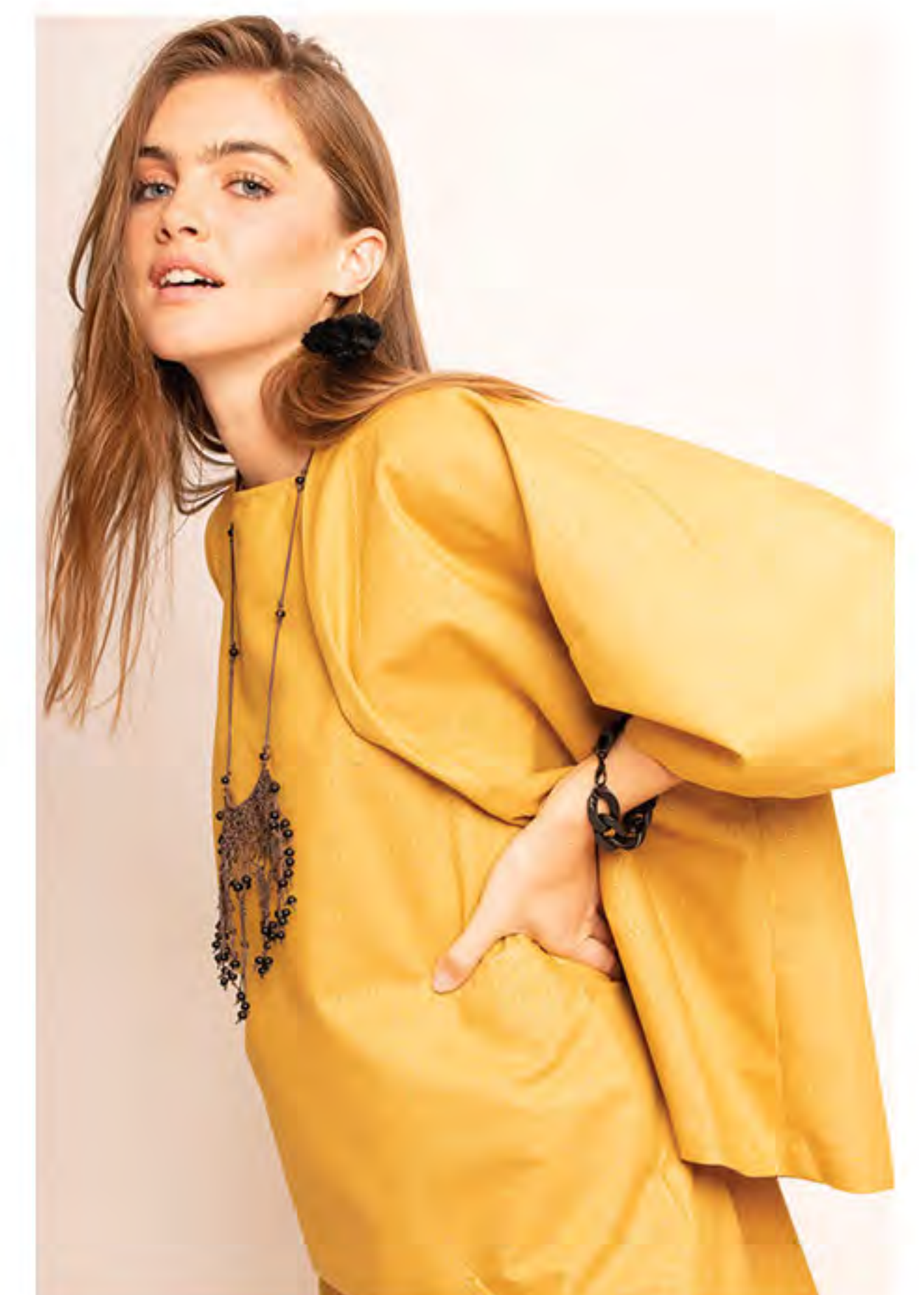
Style: Ryder kimono Color: Vermeil Fabric: organic cotton Sizes: O/S Wholesale: $92 RRP: $185