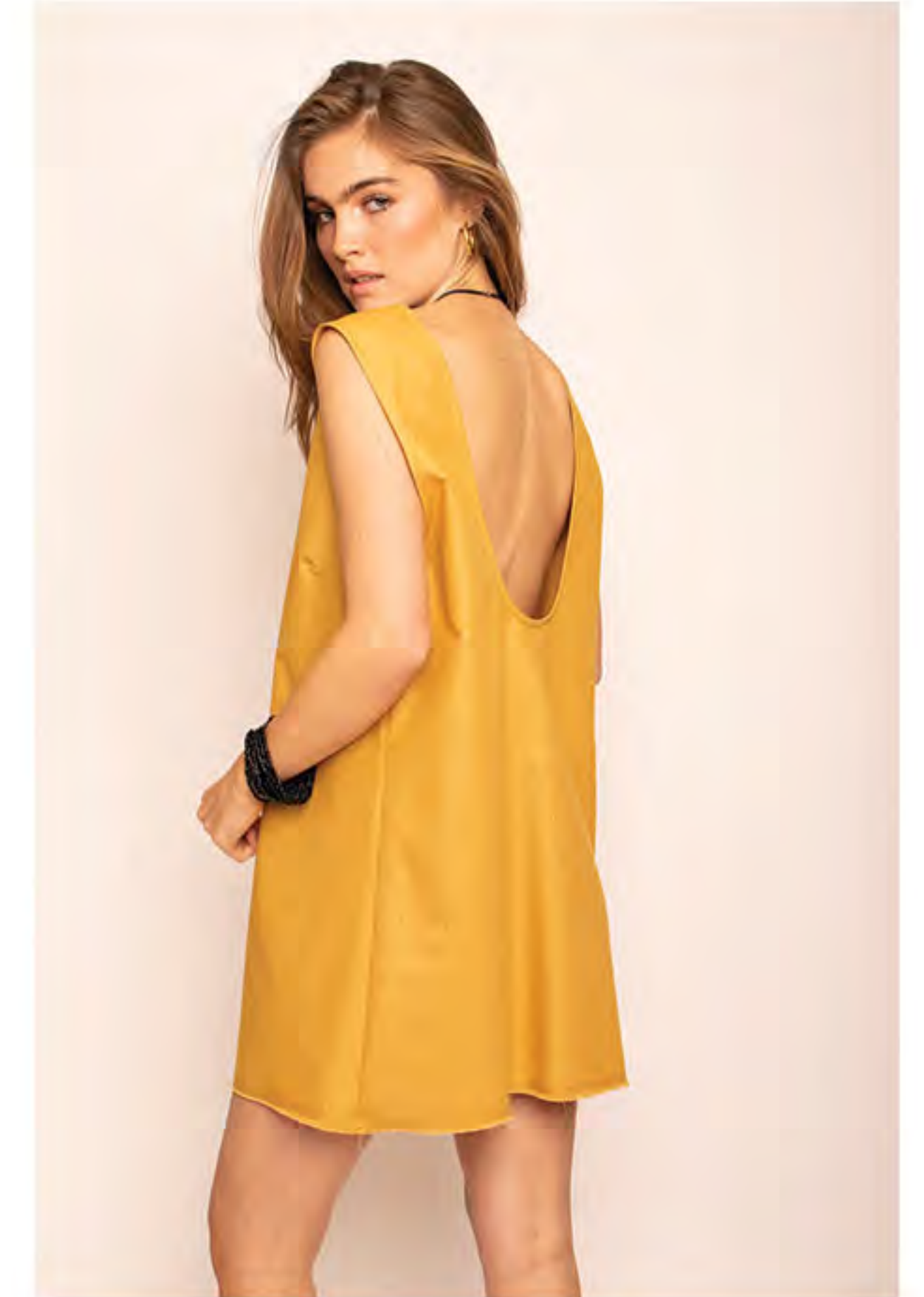
Style: Hudson dress Color: Vermeil Fabric: organic cotton Sizes: O/S Wholesale: $92 RRP: $185