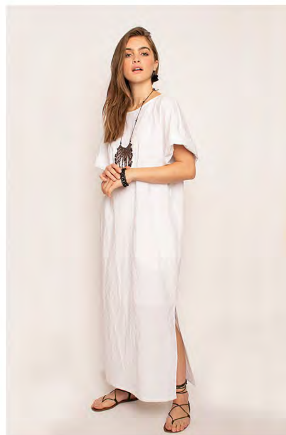
Style: Didion dress Color: Ghost Fabric: organic cotton Sizes: XS S M L Wholesale: $110 RRP: $220