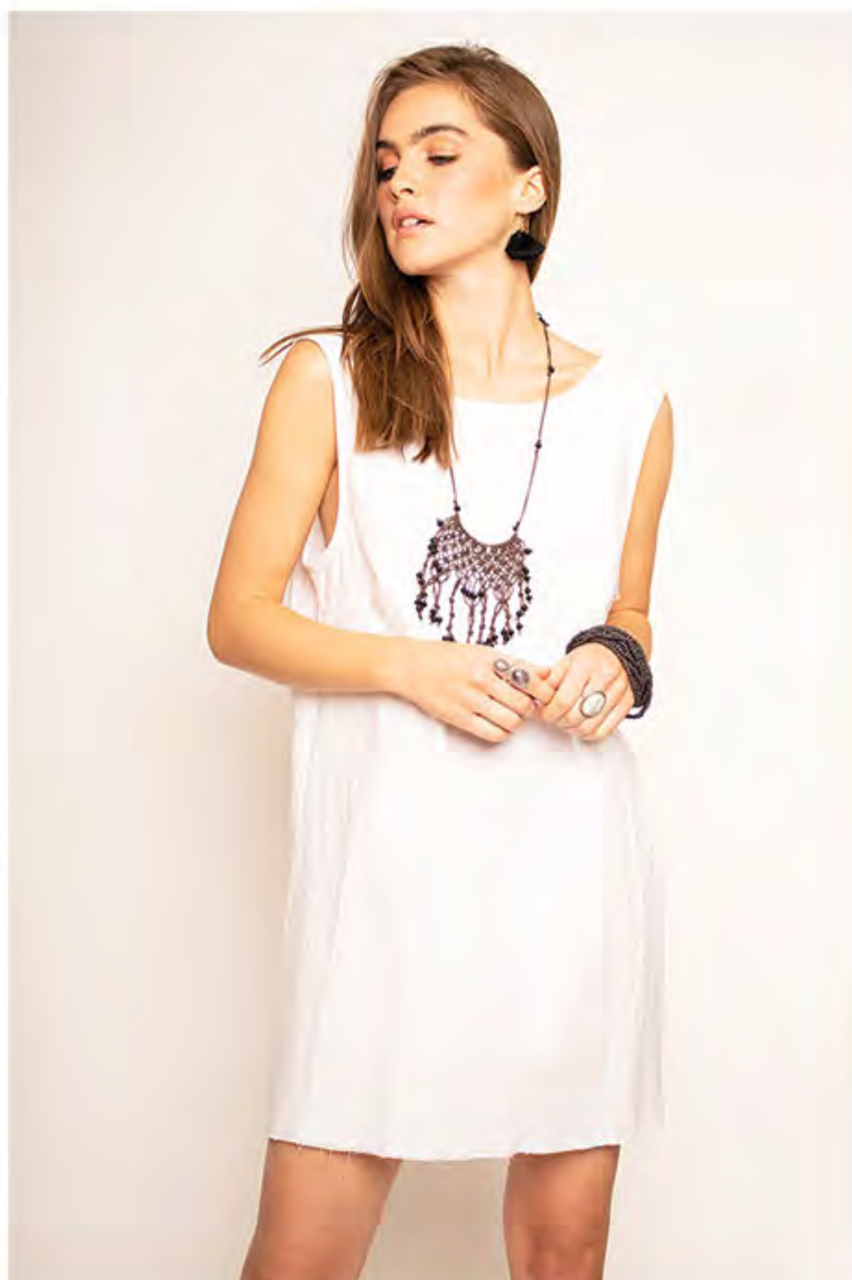
Style: Hudson dress Color: Ghost Fabric: organic cotton Sizes: O/S Wholesale: $92 RRP: $185