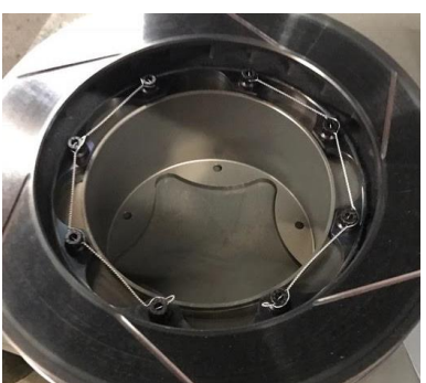
Figure 2 - Properly installed safety wire