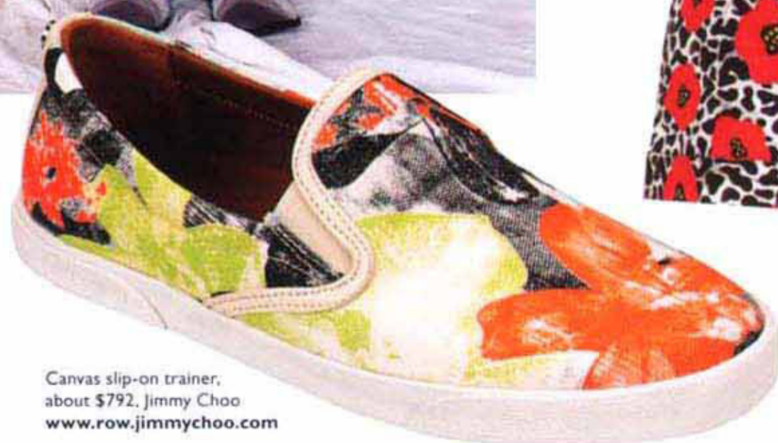
Canvas slip-on trainer, about $792, Jimmy Choo www.row.jimmychoo.com