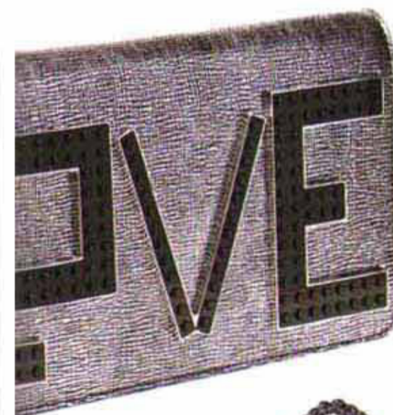
Leather clutch, Les Petits Joueurs at www.laprendo.com