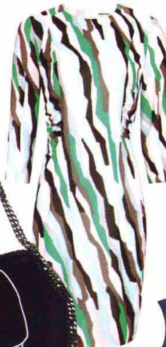
Cotton bodycon dress, about $327, www.whistles.co.uk