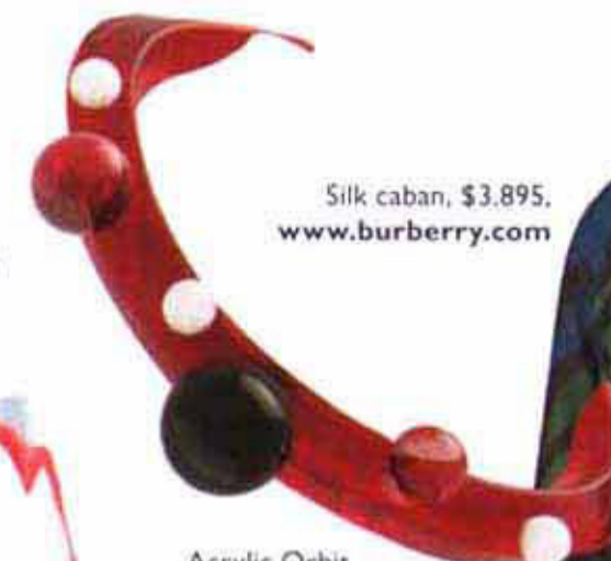
Acrylic Orbit choker, about $929, www.larabohinc.com