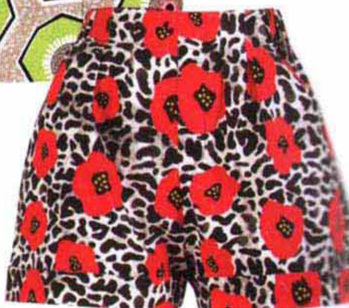
Cotton and polyester shorts, about $188, Daydream Nation at www.shop.sheshops.com