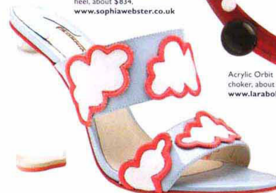
Patent leather mule with plexi heel, about $834, www.sophiawebster.co.uk