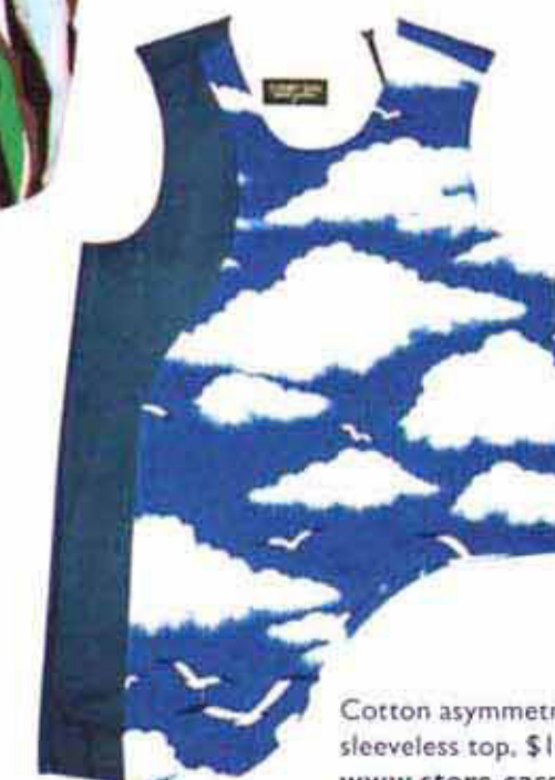
Cotton asymmetrical sleeveless top, $149, www.store.casseygan.com