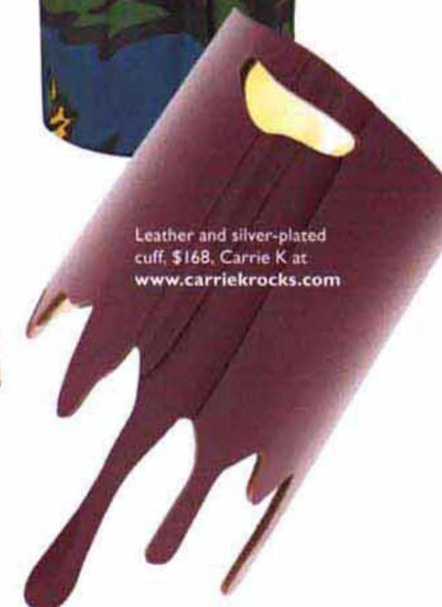
Leather and silver-plated cuff, $168, Carrie K at www.carriekrocks.com