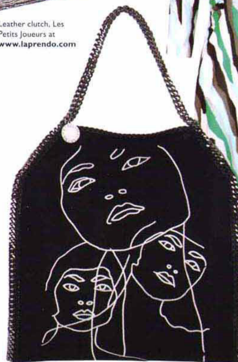
Embroidered wool bag, about $1,333, www.stellamccartney.com.sg