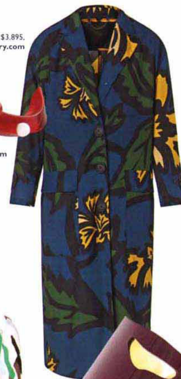
Silk caban, $3,895, www.burberry.com