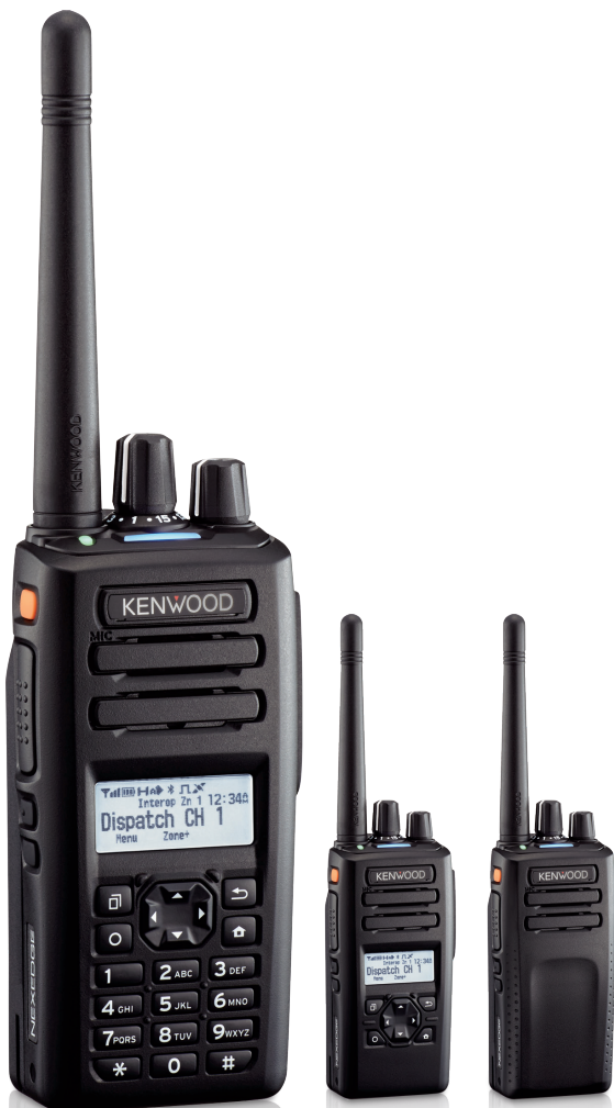
Full Keypad Model