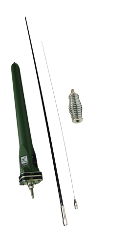
9350 Antenna parts (main assembly, fibreglass whip, stainless steel whip and spring)