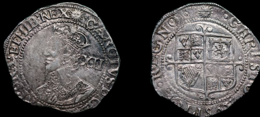
Charles I, (1625 - 49) ,Tower Mint under Parliament (1642 - 49) Shilling, Group F, mm. Sun (S 2801; Sharp G3/2)

A very handsome coin, mint brilliance and a good very fine