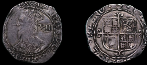
Charles I, (1625 - 49) ,Tower Mint under Parliament (1642-49) Shilling, Group F, mm. Eye (S 800; Sharp G1/2)