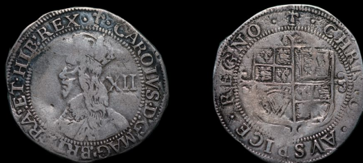
Charles I (1625-1649), Tower mint under Parliament (1642-49), Shilling, Group F, type 4.5, mm. Sceptre (S.2802; Sharp H1/1).