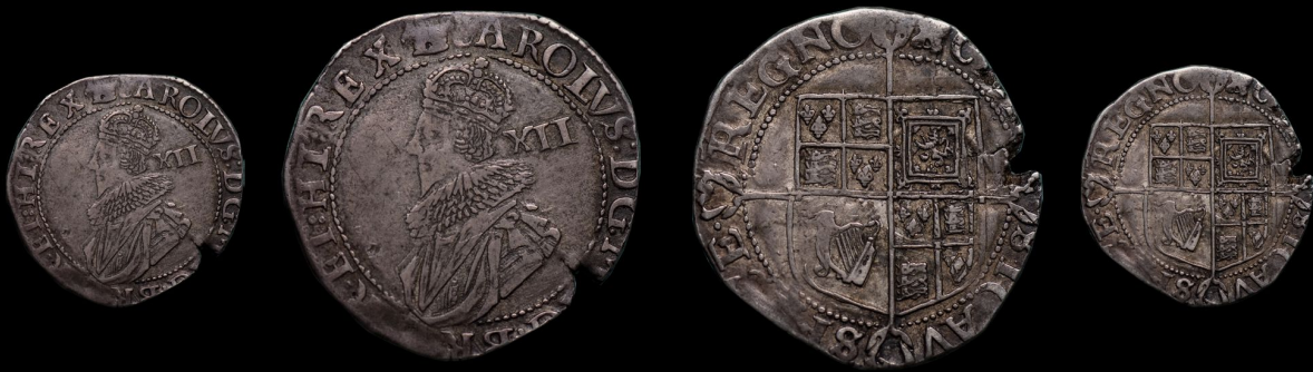
Charles I, (1625 - 49) ,Tower Mint under the King (1625 - 42) Shilling. (Group B, type 1b2, mm. castle over negros head, bust 1, colon stops on obv., no stops on rev.(S 2784; N.2218; Sharp B1/1)

The flan a little ragged however a clear and well defined portrait.