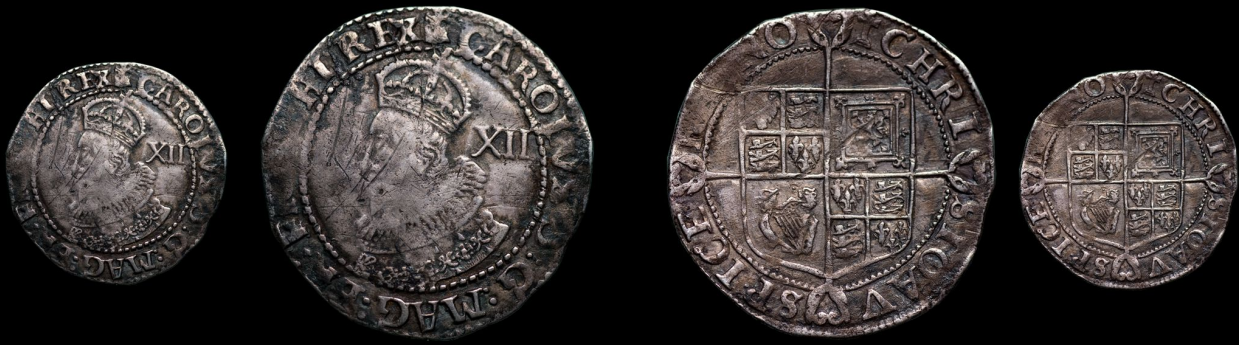
Charles I, (1625 - 49) ,Tower Mint under the King (1625 - 42) Shilling, Group A, mm. cross Calvary (over lis on obv.), bust 2, (S 2782; N.2216; Sharp A2/1; Brooker –)

Bust marked, otherwise approaching very fine, the mint-mark very rare on a heavyweight coin; a combination not represented in the Ashley, Brooker, Hughes, Osborne or Shuttlewood collections.