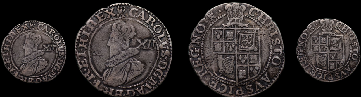
Charles I (1625-1649), Tower mint under the King (1625 - 42), Shilling, Group B, type 1b2, mm. castle, bust 2, plume above shield (Sharp B2/2; SCBI Brooker 416; N 2220; S 2785).

Deliberate X in front of the kings face (something many shillings from this period of Charles I reign seem to have. Possibly from a non royalist uprising?) otherwise rare