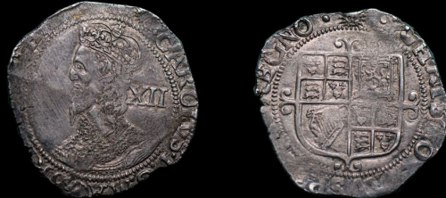
Charles I, (1625 - 49) ,Tower Mint under Parliament (1642 - 49) Shilling, Group F mm. Sun (S 2800; Sharp G2/2)