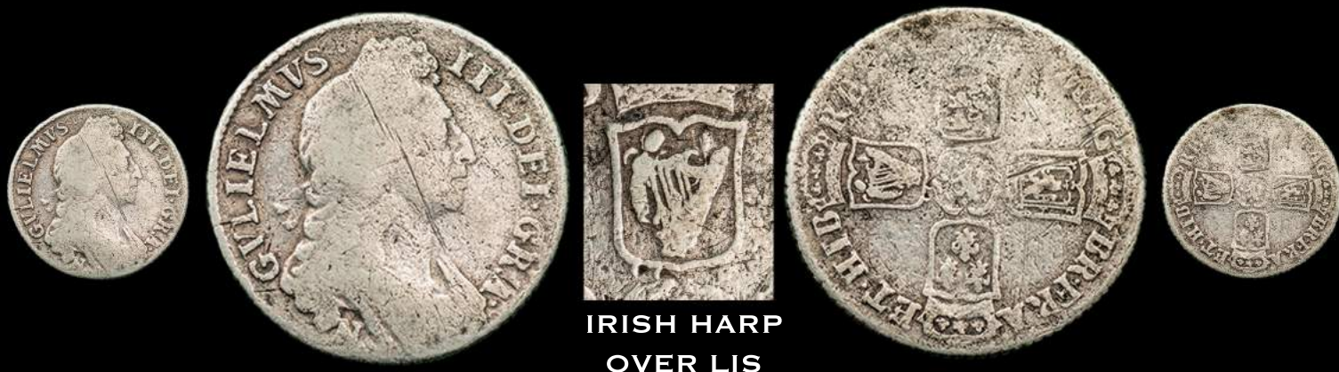
IRISH HARP OVER LIS