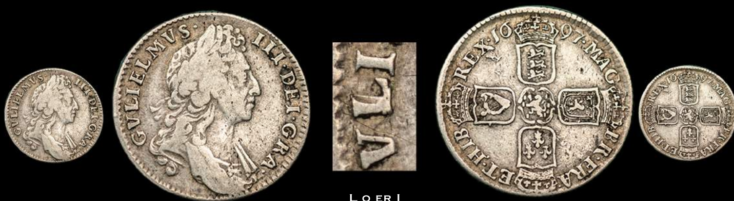
L O E R I