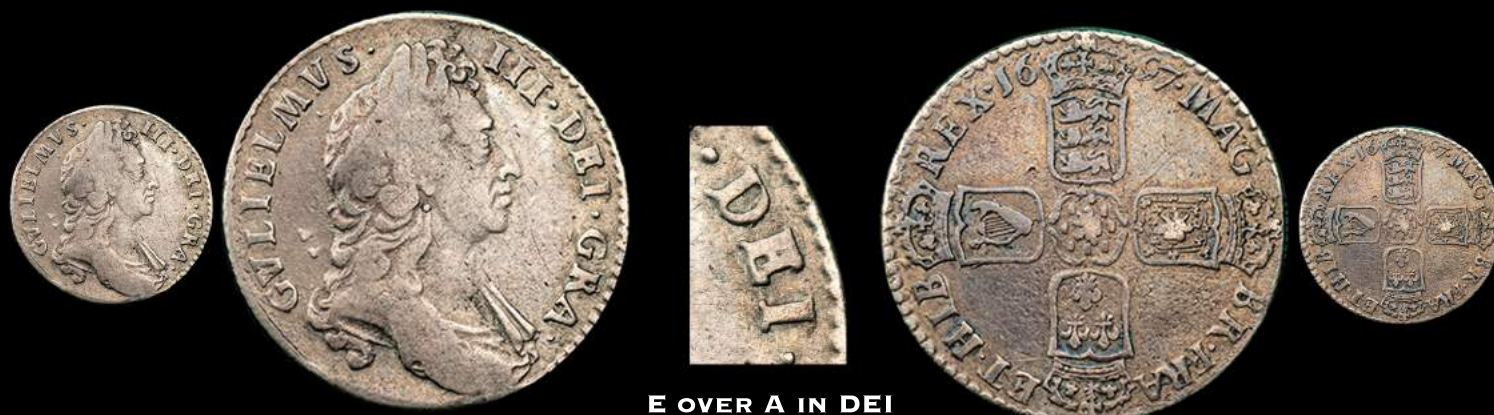
E OVER A IN DEI