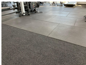
Create Custom Segments