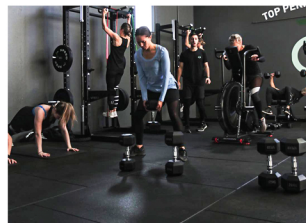
Compliments all gym types