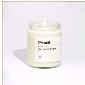
Paloma 8 oz Soy Candle $13 WSP / $26 RRP

Top: lavender Mid: frankincense, myrrh Base: amber, oud, resin