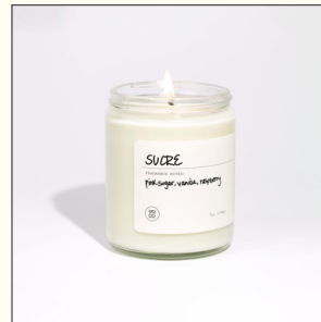
Sucre 8 oz Soy Candle $13 WSP / $26 RRP

Top: lime, grapefruit Mid: peach, watermelon, honeydew Base: musk