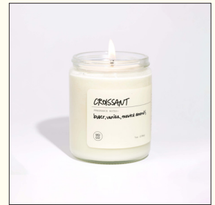
Croissant 8 oz Soy Candle $13 WSP / $26 RRP

Top: grass, bergamot, cassis Mid: tobacco leaves, rose Base: musk, cedar, leather