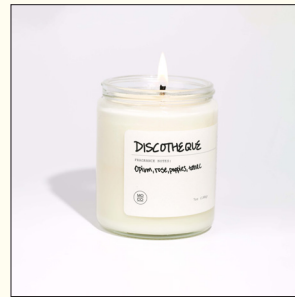
Discotheque 8 oz Soy Candle $13 WSP / $26 RRP

Top: lime, peach, papaya Mid: jasmine, benzoin Base: tonka, cream, amaretto