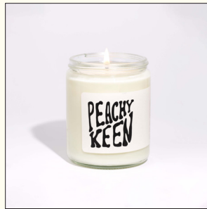
Peachy Keen 8 oz Soy Candle $13 WSP / $26 RRP

Top: orange, mandarin Mid: sriracha, chili pepper Base: dark musk, sandalwood