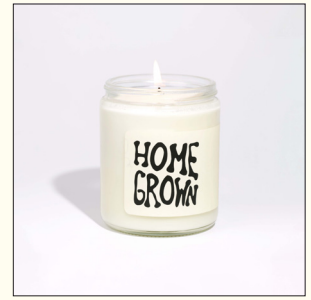
Home Grown 8 oz Soy Candle $13 WSP / $26 RRP

Top: apple, orange, effervescence Mid: red wine, black cherry, blackcurrant Base: amber, oak