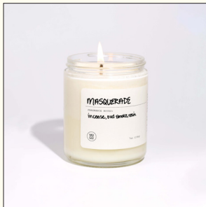
Masquerade 8 oz Soy Candle $13 WSP / $26 RRP

Top: honey Mid: toasted almonds Base: vanilla, bourbon, butter