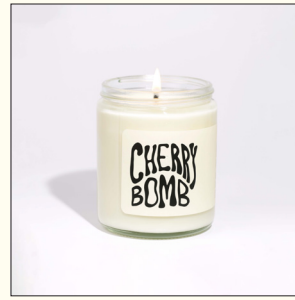
Cherry Bomb 8 oz Soy Candle $13 WSP / $26 RRP

Top: orange, lemon Mid: agave, aloe, poppies Base: patchouli, sage, cedar