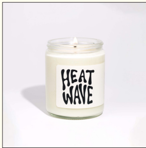
Heat Wave 8 oz Soy Candle $13 WSP / $26 RRP

Top: lime, coconut Mid: hemp, shea, sweet almond Base: vetiver, patchouli