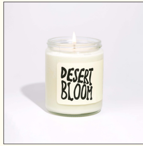
Desert Bloom 8 oz Soy Candle $13 WSP / $26 RRP

Top: ozone, cucumber Mid: lavender, chamomile Base: vanilla, cream