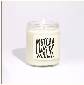
Matcha Milk 8 oz Soy Candle $13 WSP / $26 RRP

Top: ozone, cucumber Mid: lavender, chamomile Base: vanilla, cream