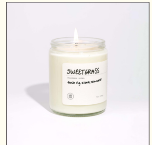
Sweetgrass 8 oz Soy Candle $13 WSP / $26 RRP

Top: raspberry, strawberry Mid: blackcurrant, sugar Base: tonka, vanilla