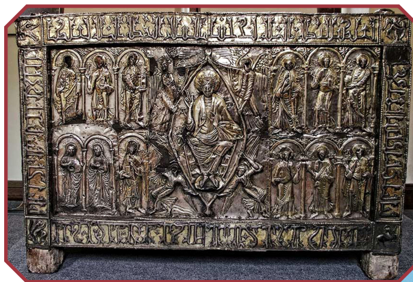
Left, the large, silver-covered reliquary containing the Sudarium and other relics. Below, an illustration of how Jesus' head was tilted on the Cross when first covered with the Sudarium.