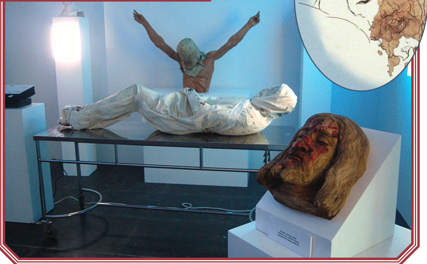
Objects on display depicting how the Sudarium was wrapped around Christ's head on the Cross (rear of photo), how He was wrapped in the burial shroud (mid-center), and a 3-D mask of the Face on the Shroud of Turin depicted with the blood stains from the Sudarium