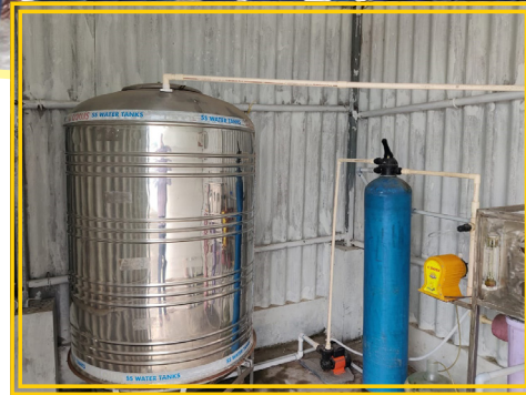
Care for a drink? Our boarders at St. Thomas and Mother Theresa Hostels are excited to have clean, cool water from the new water treatment facility at the campus