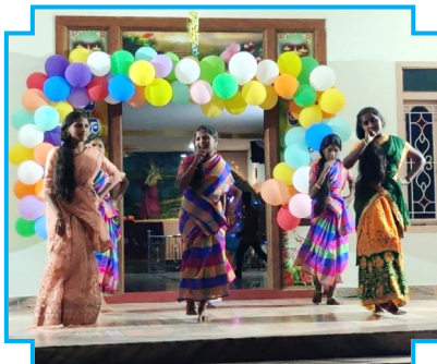
The girls performing a dance for Christmas

Merry Christmas and Happy New Year from our boarders