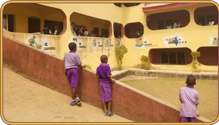
Students looking out over the courtyard at St. Joseph School in Nigeria

Amidst the many changes that have occurred over the past year, we would like to share an update on St. Joseph Orphanage and School in Ogoja, Nigeria.