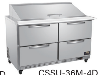
CSSU-36M-4D CSSU-48M-4D CSSU-60M-4D