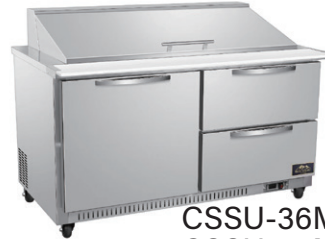
CSSU-36M-2D CSSU-48M-2D CSSU-60M-2D