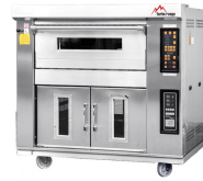
Optional : FE-2T (Deck oven)