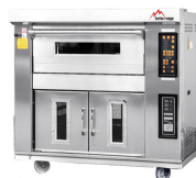
Optional : FE-P (Deck Proofer)