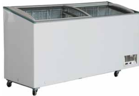
CF-470CG CF-550CG CF-720CG CF-790CG