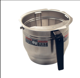
FUNNEL AY, W/DECAL GRT "C"7.12