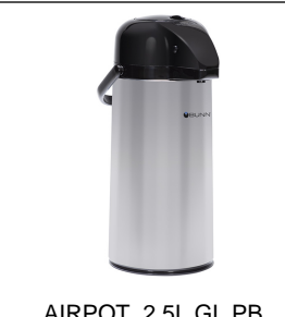
AIRPOT, 2.5L GL PB SINGLE PK