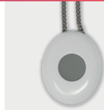
Backup pendant (PEARL)

Voice messages will guide you through the installation process step by step. After completing all the set-up steps, place a test call using your in-home alarm unit (EVA) and backup pendant (PEARL).