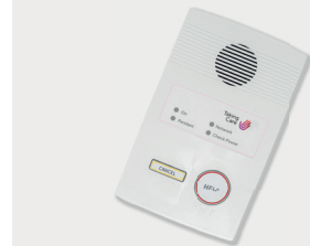
In-home alarm unit (EVA)

An operator will answer and speak to you via your in-home alarm unit (EVA). The operator will then end the call and call you back on your telephone to check our outgoing connection.