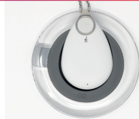
GO alarm pendant on charging base

Choose where to put your GO alarm charging base, found in Sections 2 & 3 of the box and plug it into the mains. Start charging your GO alarm pendant ( Section 3 of the box).