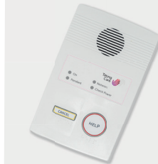
In-home alarm unit (EVA)

Next take out your in-home alarm unit (EVA) and your backup pendant (PEARL), found in Section 1 of the box.