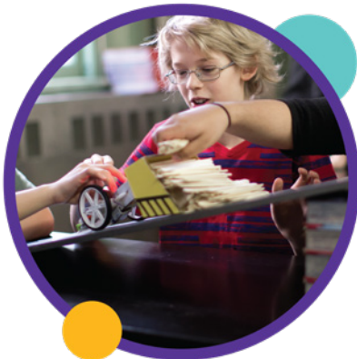
Teaching Physics with littleBits Robots

In addition to the learning activities provided by littleBits, review the resources below for some ideas for integrating littleBits into STEAM education: