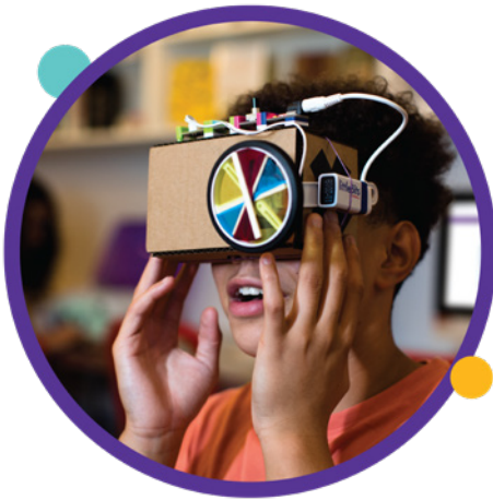
Exploring How littleBits Work

Are you wondering where to start with littleBits in your educational setting? The best way is to jump right in and learn by experimentation and play! The littleBits team has developed a few mini-lessons designed to introduce you and your students to littleBits. Each lesson takes about one hour.