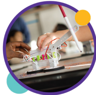
How to Use littleBits the Robot for Incredible STEM Lessons