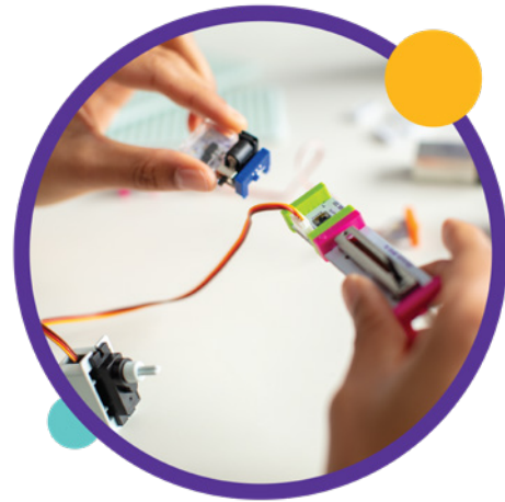
Reverse Engineering with littleBits

Once you've completed the Mini-Lessons, try out a curated selection of inventions and lessons to get started with littleBits Classroom.