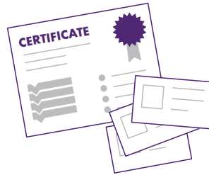
Tools for Your Classroom