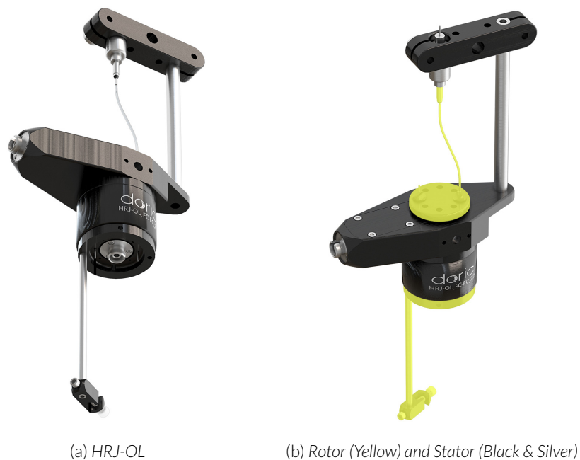
Figure 1.1: Fiber-optic & Liquid Rotary Joint

The Fiber-optic & Liquid Rotary Joint (HRJ-OL) (Fig. 1.1b) is a hybrid rotary joint that allows the transmission of light & fluid during rotation. These rotary joints are ideal for use with Opto-fluid Cannulas (OFC) . Two different models exist, one using 22 gauge tubing, the other 25 gauge. The system uses 8 interchangeable metal tubes for the transmission of fluid.