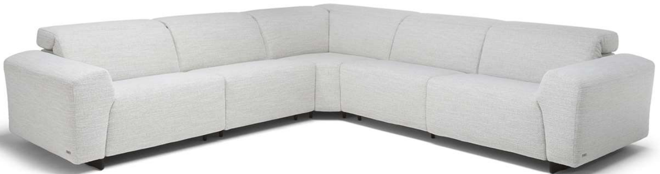
■ Vers. 272+291+489+291+F52