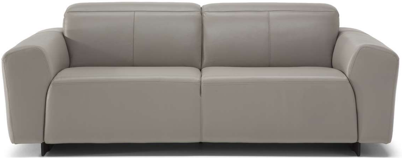
■ Vers. 009