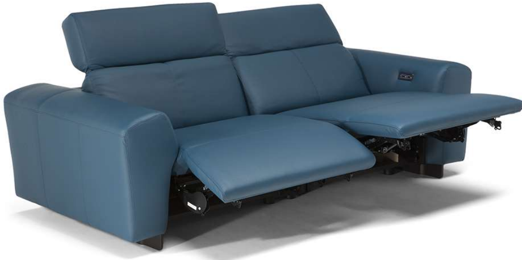
■ Vers. F46