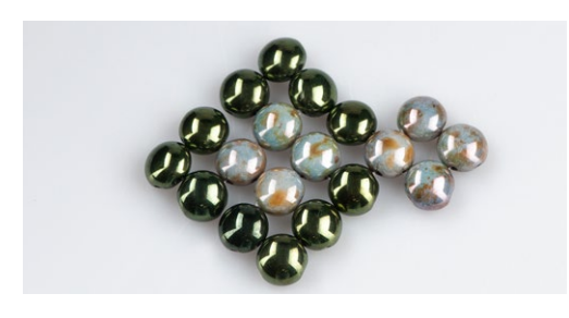
Step 5: Sew 3 C1 to the two side C2