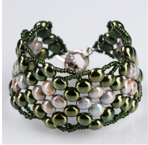
DESIGN BY HELENA CHMELÍKOVÁ

Tie off the line using three knots. Pull the ends into the surrounding C 1. Cut it off.