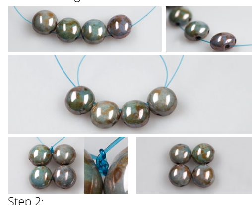
Sew 3 C1 to the three C2

Place 4 C2 next to each other. The bulging section should be at the top. Thread them all through the same holes. Thread the line through the holes in the same direction once again. Tie off the line using three knots. Pull the ends of the lines into the holes. One to the right and the second to the left.