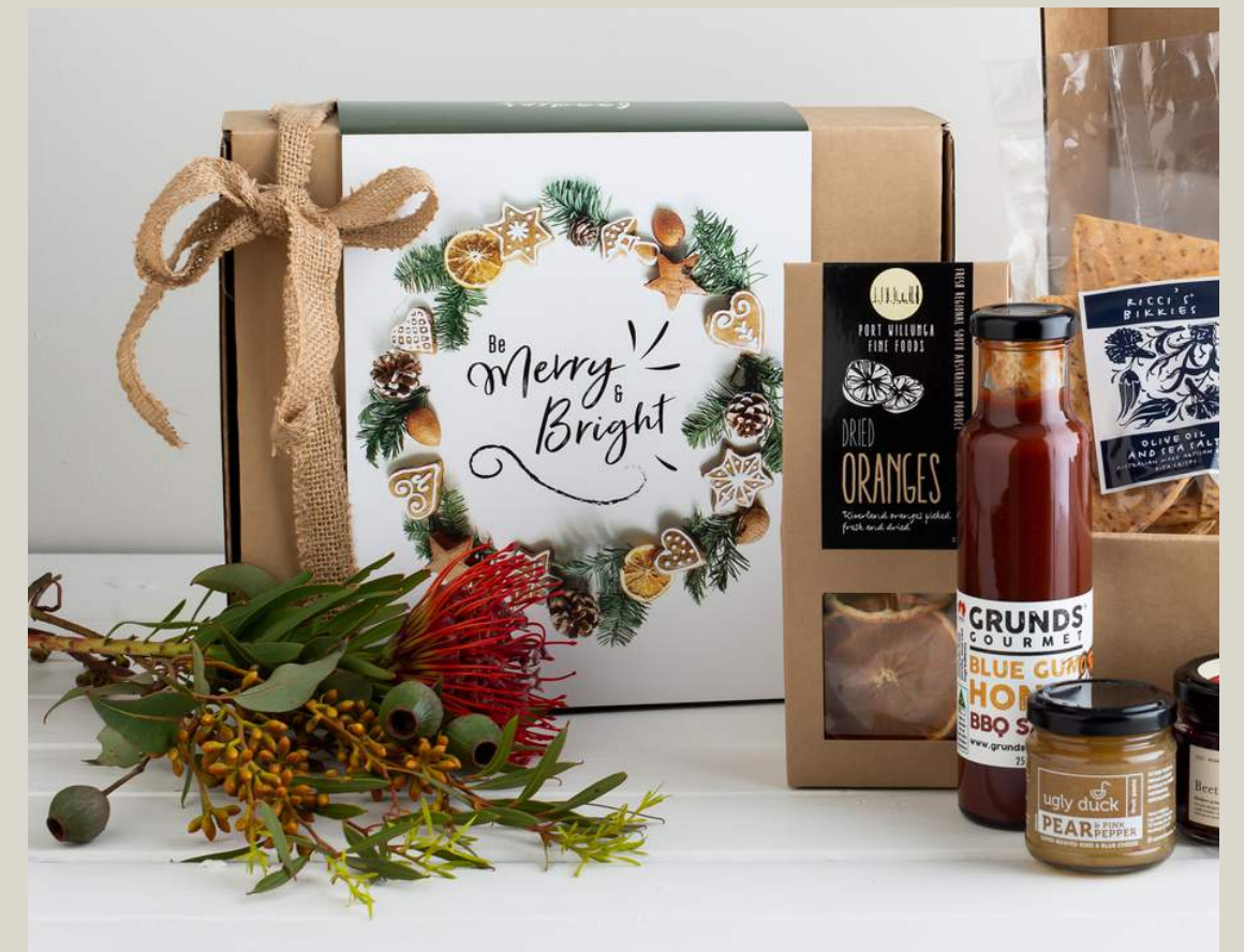
special edition Christmas option