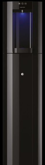
Black - Floorstanding