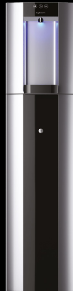
Silver - Floorstanding