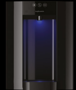
Black - Countertop