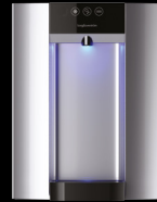
Silver - Countertop

Installation Kit with 3M Filter Filtration and hygiene assurance with Biomaster.