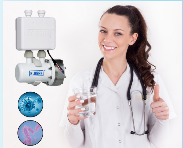
The Klaran UVC LED Shield is designed to destroy Bacteria and Viruses to protect your health

LED Technology has revolutionised the Lighting Industry. Klaran UVC LED has now applied the same breakthrough Technology to the Water Cooler Industry, offering significant improvements in all round performance.