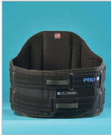
PRO-V3 L0627 12" back height – LSO Standard 7" front