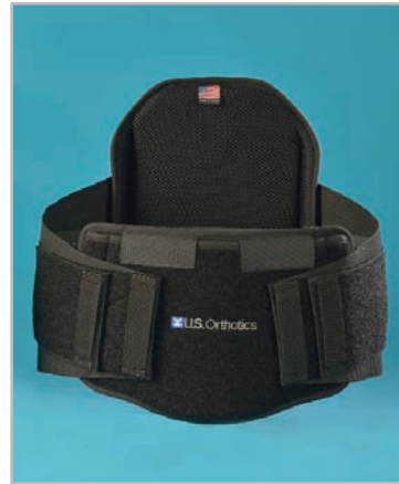
PRO-V9 L0631 14" back height – LSO Standard 9" front – Model V9 Low profile 7" front – Model V10 2 piece design