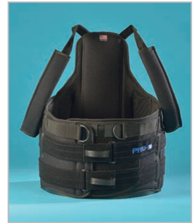
PRO-V6 L0456 18" back height – TLSO Standard 9" front – Model V6 Low profile 7" front – Model V7