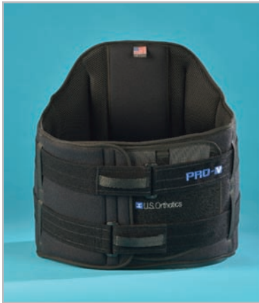
PRO-V1 L0637 14" back height – LSO Standard 9" front – Model V1 Low profile 7" front – Model V2

Our professional grade V-Line ® Spinal Orthoses series features comfort, stability and a wide array of options. A single piece design makes for easy application and effective compression. Pre-molded posterior inserts come in 0° – 7° – 12° – 25° lordosis with a spinal relief cut-out. Pre-molded anterior inserts comes neutral or pendulus and are pre-slotted to accommodate an anterior thoracic extension. The anterior pocket is fully adjustable providing correct positioning and accommodating a wider range of sizes. Designed with two smooth cross-pull compression straps, with elastic tension ends. Hand-pull tabs on all ends.