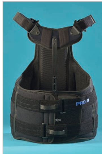
PRO-V20 L0456 Model V6 with the addition of an ATE