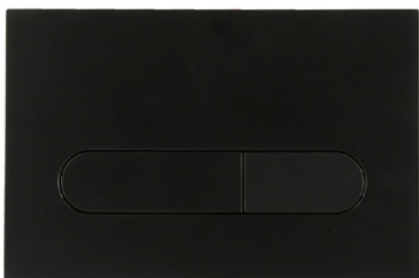
Black semi-matte finish