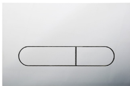
Chrome metallic finish