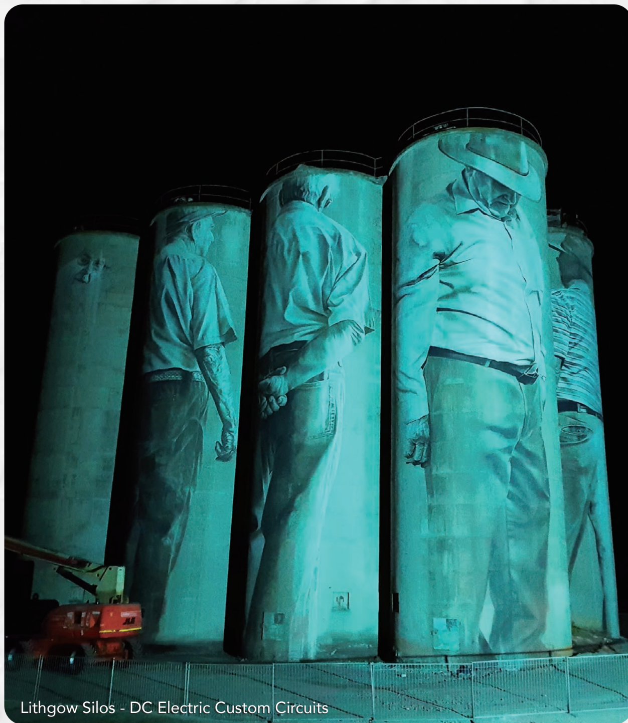
Lithgow Silos - DC Electric Custom Circuits