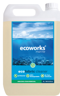
10 Litres EWM10201