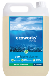
5 Litre EWM10153