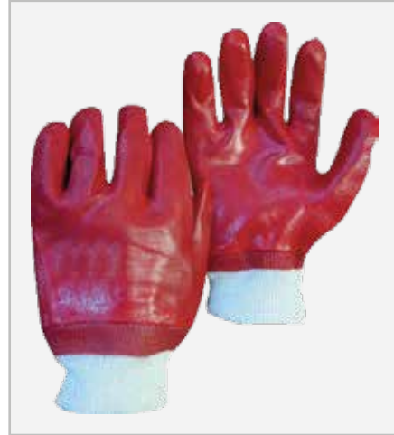
PVC Smooth Palm Knit Wrist