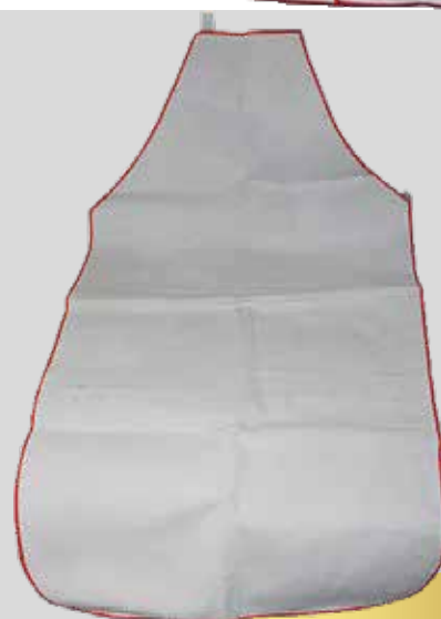
Chrome Leather Apron