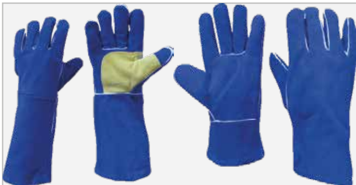
Blue Line Welding Available in Shoulder, Elbow and Wrist Length