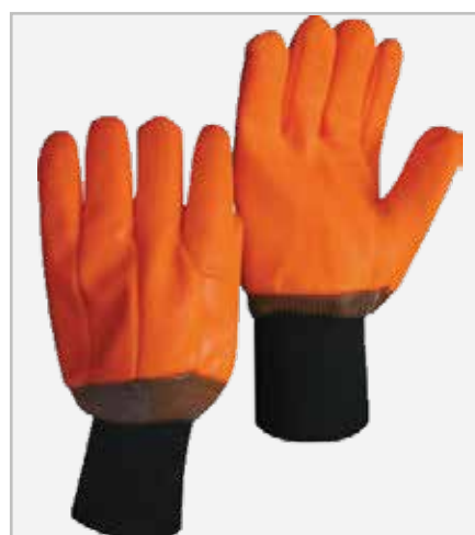
Fluorescent Orange Knit Wrist Freezer Glove