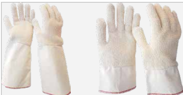
Seamless Terry Toweling Open Cuff Available in Shoulder, Elbow and Wrist Length