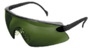
Sporty Goggle with adjustable frame