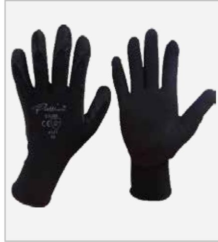
Nitrile Coated Nylon Fully Dipped Black