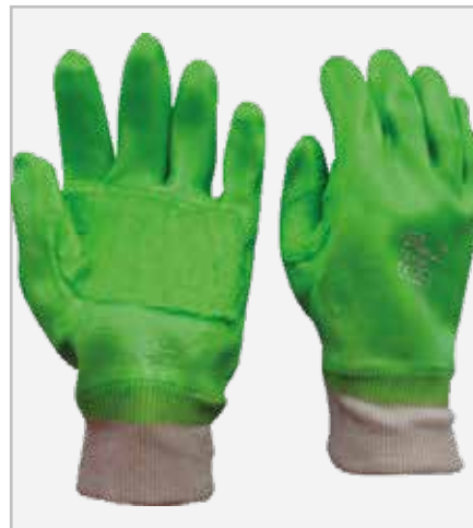
PVC Green Reinforced Palm Knit Wrist