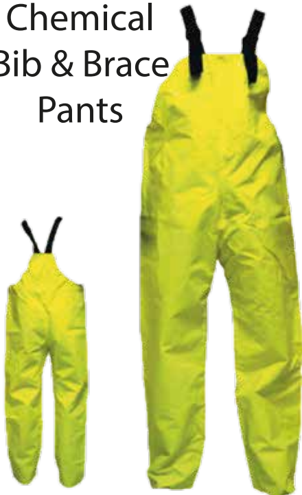
Chemical Bib & Brace Pants