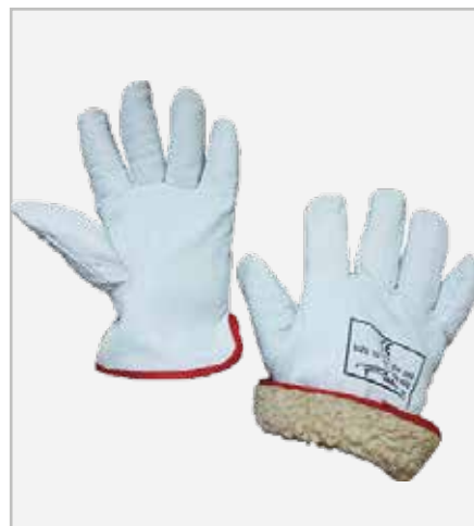
Tig Welding Glove Goat Skin Wool Lined