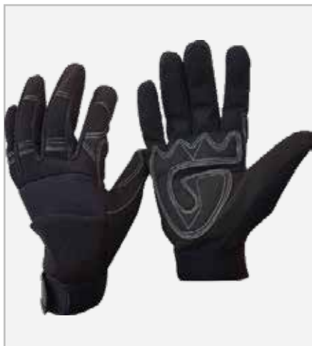
Mechanical Gloves Padded Palm