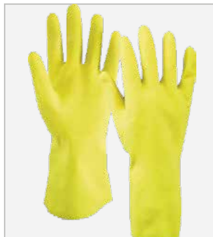
Yellow Household Flocklined Glove