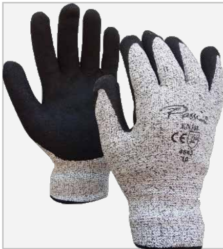
Cut Resistant Challenger