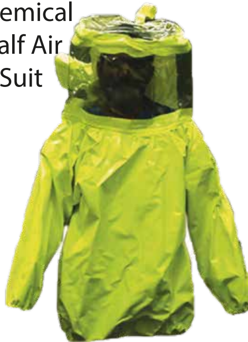
Chemical Half Air Suit