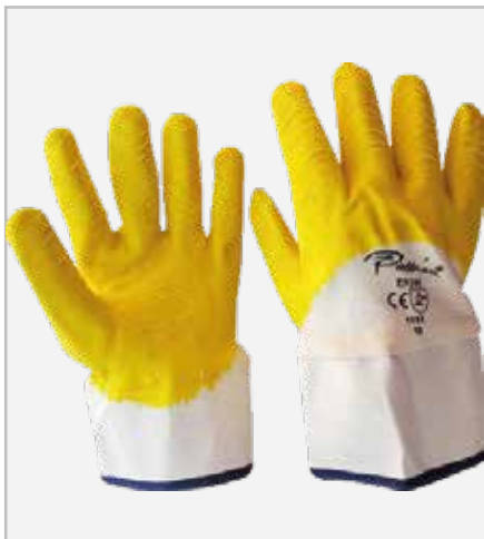
Yellow Comarex Full Dip Open Cuff