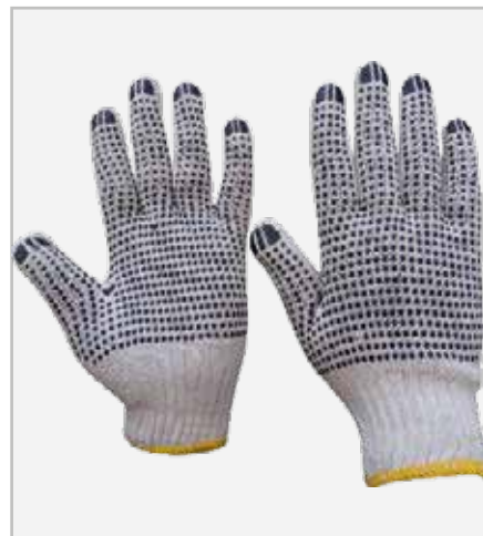
Seamless DoubleSide Polka Dot Gardening Glove