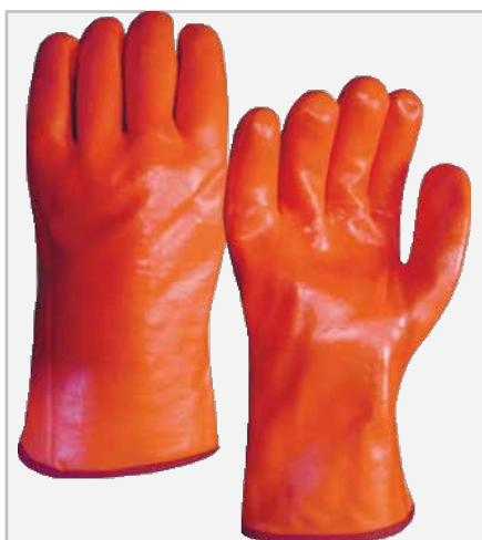
Fluorescent Orange Open Cuff Freezer Glove