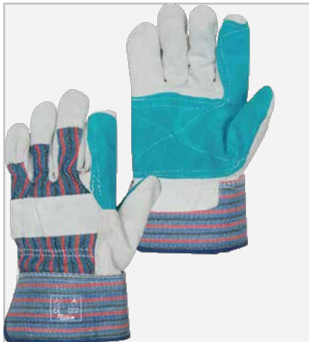
Chrome Leather Candy Stripe + Reinforced Palm & Thumb