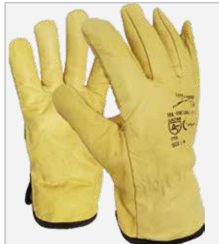
Yellow Leather with Fleece Lining