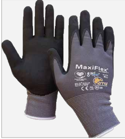
MaxiFlex Palm Dipped