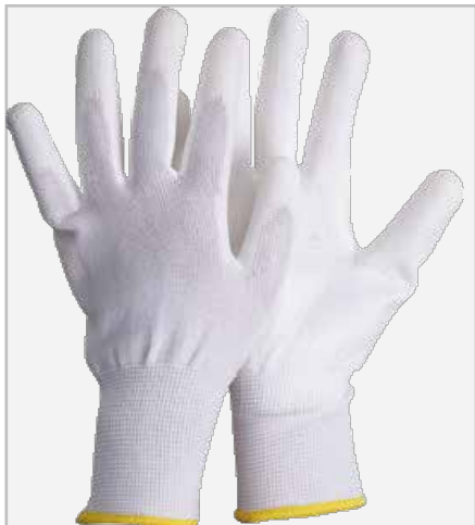
PU White Coated Nylon Palm Dipped