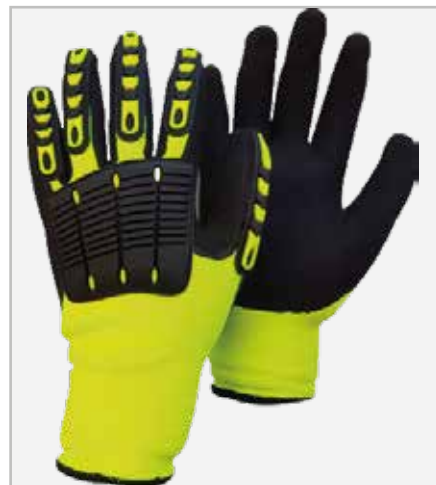
Impact Nitro Sandy Finish