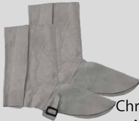
Chrome Leather Ankle Spats