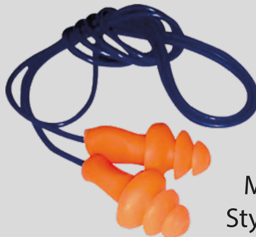
Reusable Mushroom Style Earplugs