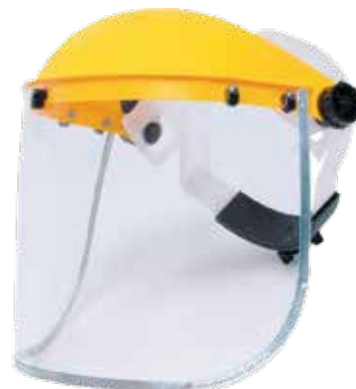
Face Shield with Brow Guard