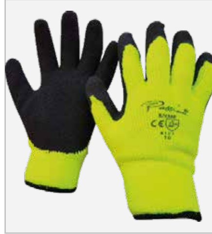
Black Latex Coated Thermal