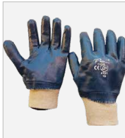
Blue Nitrile Knitted Cuff