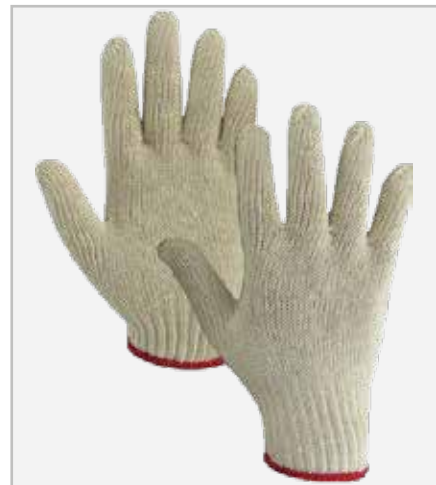
7GG 500gpd Cotton Crochet Gloves