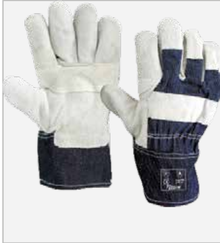
Chrome Leather with Denim Cuff