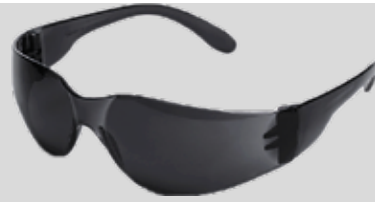
Sporty Specticals Black Frame