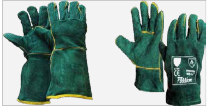
Green Line Welding Available in Shoulder, Elbow and Wrist Length