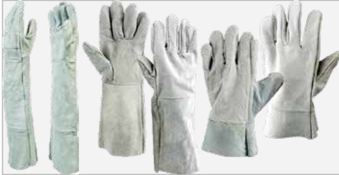
Chrome Leather Welding Available in Shoulder, Elbow and Wrist Length