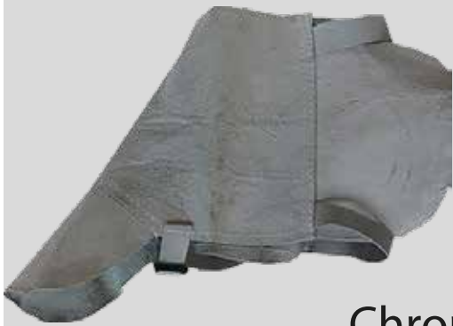
Chrome Leather Knee Spats