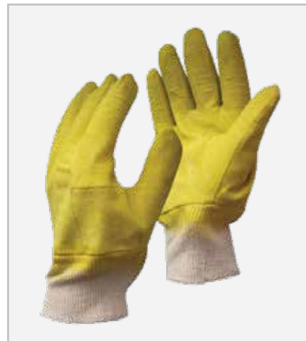
Yellow Comarex Full Dip Knit Wrist