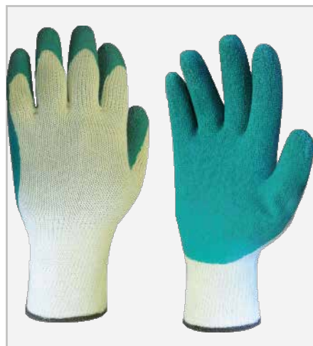
Green Rubber Coated Gripper Heavy Duty