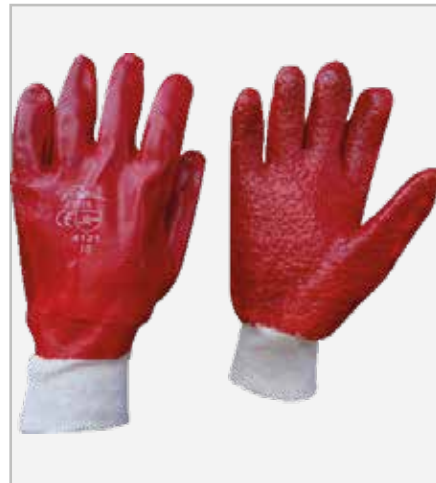
PVC Heavy Duty Rough Palm Knit Wrist