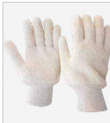
Seamless Terry Toweling Knit Wrist