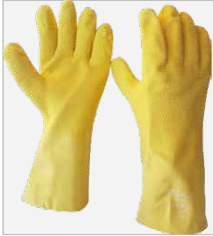
Latex Gripper Open Cuff