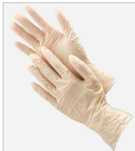
Examination Powdered Gloves