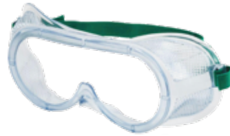
Mono Goggle + Adjustable Headband