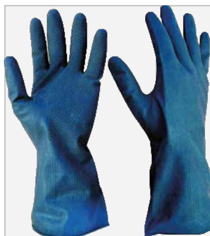
Builder Gloves Black