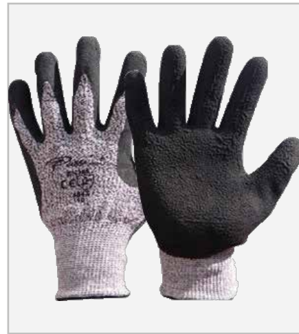
Cut Resistant Gripper