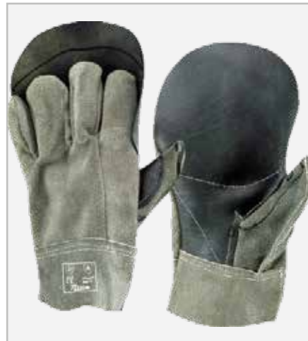
Chrome Leather with Apron Palm + Fingers