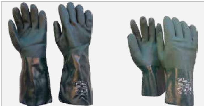
PVC Double Dip Jersey Line Glove Available in Shoulder, Elbow and Wrist Length