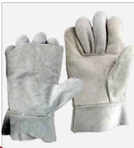
Chrome Leather with Apron Palm