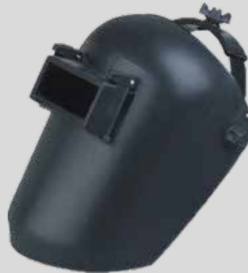
Welding Helmete with flip front