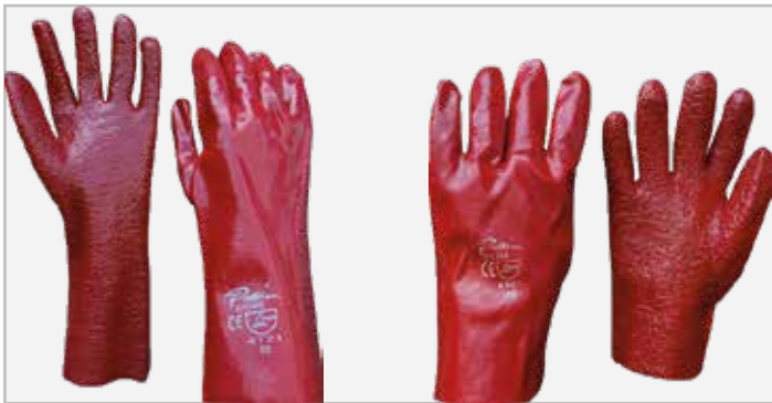
PVC Heavy Duty Rough Palm Available in Shoulder, Elbow and Wrist Length