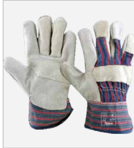
Chrome Leather Candy Stripe