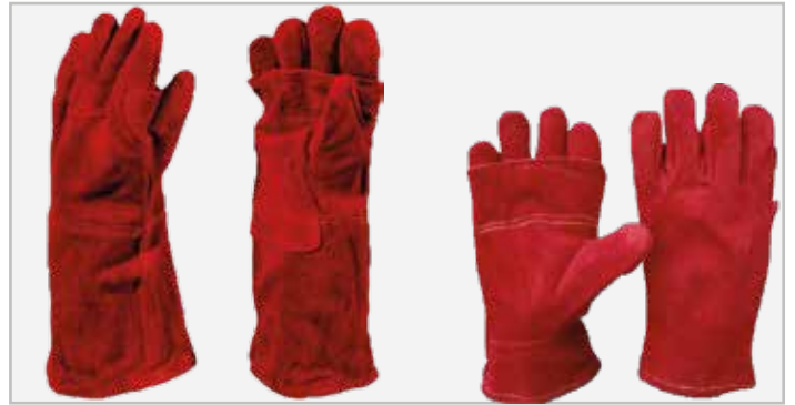
Red Heat Resistant Apron Palm Available in Shoulder, Elbow and Wrist Length