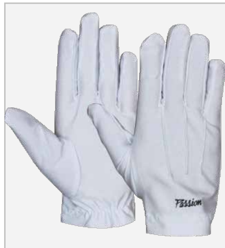
White Nylon Traffic Glove