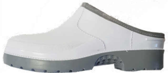
General Purpose Slip on Gumboot

Premium Food Grade Slip on Gumboot. Blood and Fat resistant.