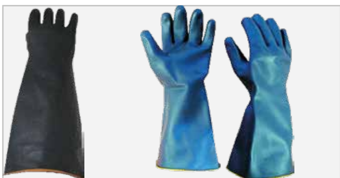
Smooth Palm Builder Rubber Gloves Available in Shoulder, Elbow and Wrist Length