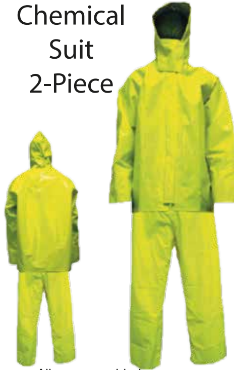
Chemical Suit 2-Piece