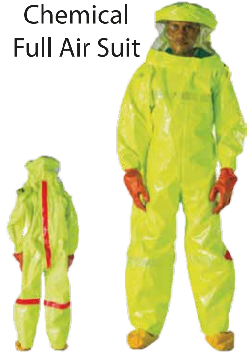
Chemical Full Air Suit