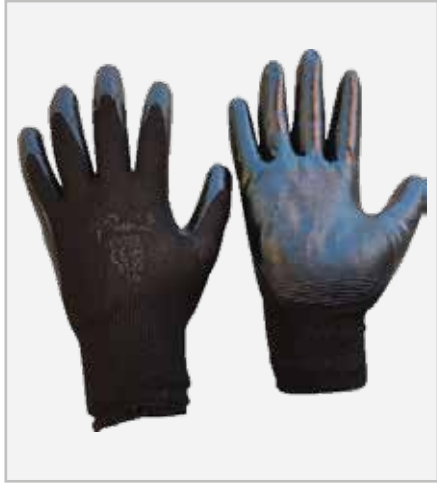
Nitrile Coated Nylon Palm Dipped Black