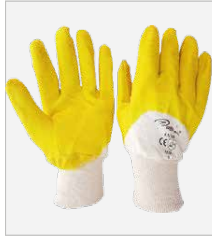
Heavy Duty Knit Wrist Jersey Lined Latex