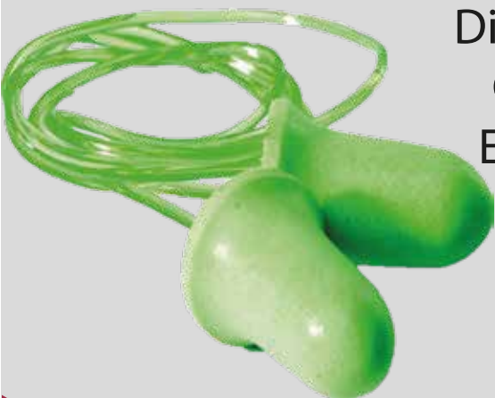
Disposable Corded Earplugs