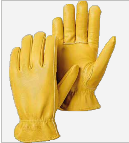
Goat Skin Rigger