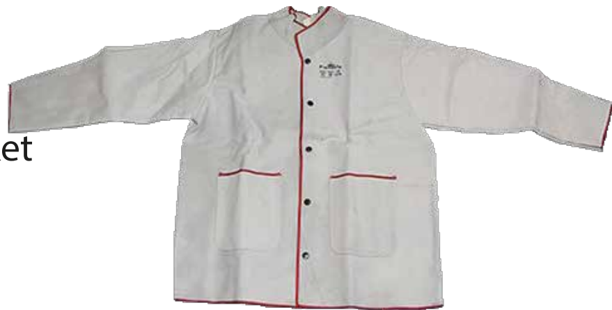
Chrome Leather Welding Jacket