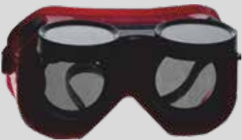
Flip Front Welding Goggle