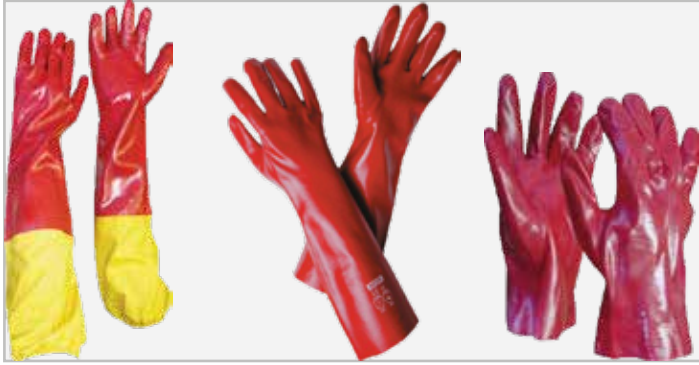
PVC Smooth Palm Available in Shoulder, Elbow and Wrist Length