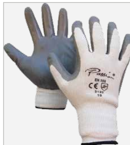
Nitrile Coated Nylon Palm Dipped Grey