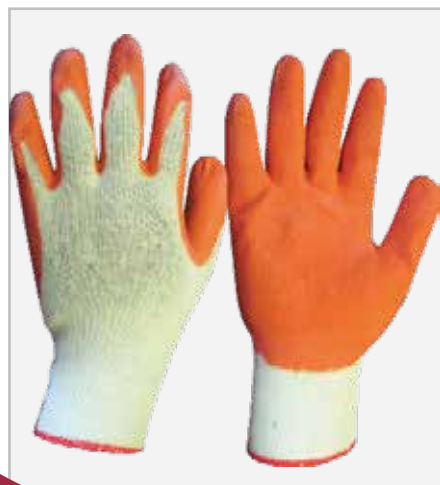
Latex Coated Cotton Palm Dipped