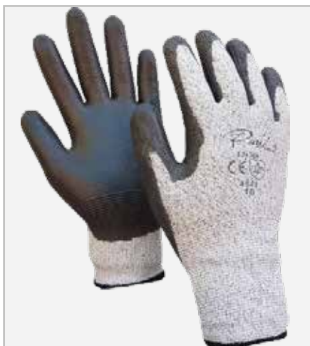
Cut Resistant Grey Level 5