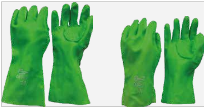
PVC Green Reinforced Palm Available in Shoulder, Elbow and Wrist Length