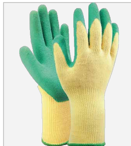
Green Rubber Coated Gripper