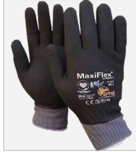
MaxiFlex Fully Dipped