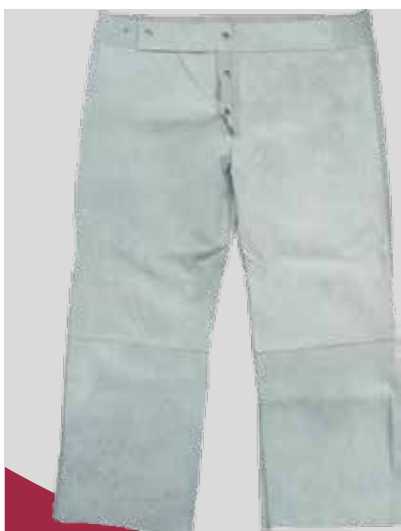
Chrome Leather Welding Trousers