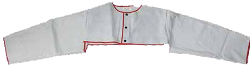
Chrome Leather Welding Yoke