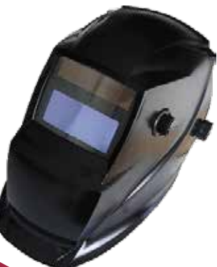
Automatic Welding Helmete with flip front