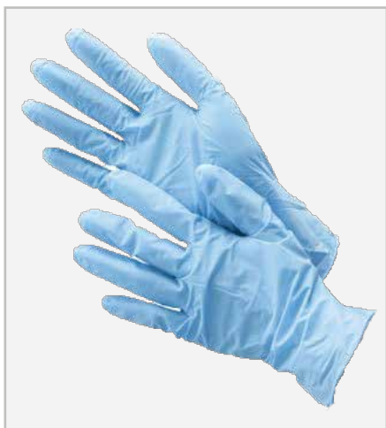
Nitrile Powder Free Gloves