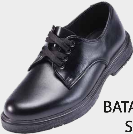
BATA CLERK SHOE