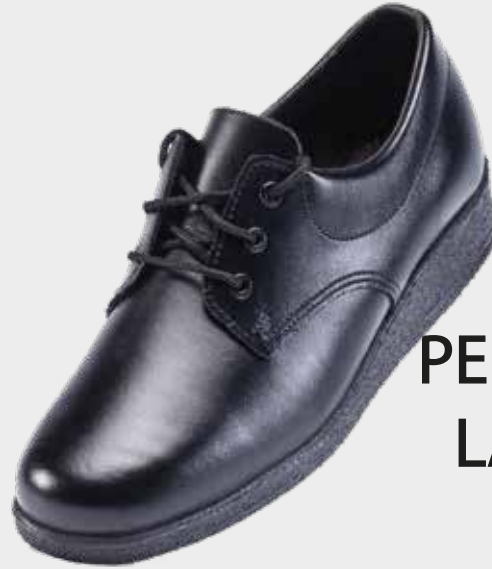
PERFORMA LACE-UP SHOE