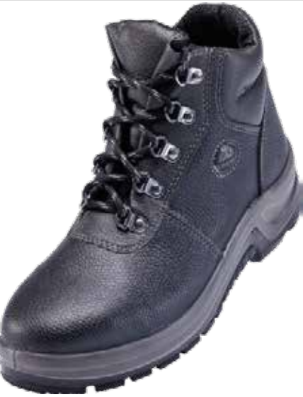
BATA ATLANTIC SAFETY BOOT