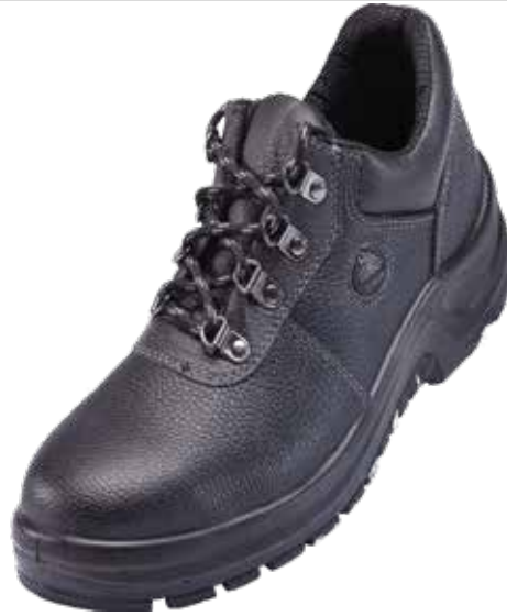
BATA PACIFIC SAFETY SHOE