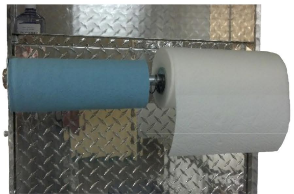
The Finished Product!

Note: Be sure to place spring in between washers.