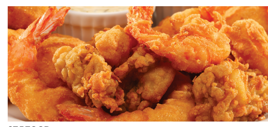
SEAFOOD House-Autry's Seafood Breader mix wraps any kind of fish fillet in a light, crispy coating with a flavorful blend of seasonings. From our Special Seafood Breader Mix to varieties specifically for fish n' chips or catfish, we have one that is right for your menu.