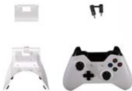
MODEL 1537, 1697, 1708