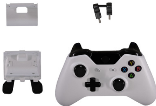
MODEL 1537, 1697, 1708