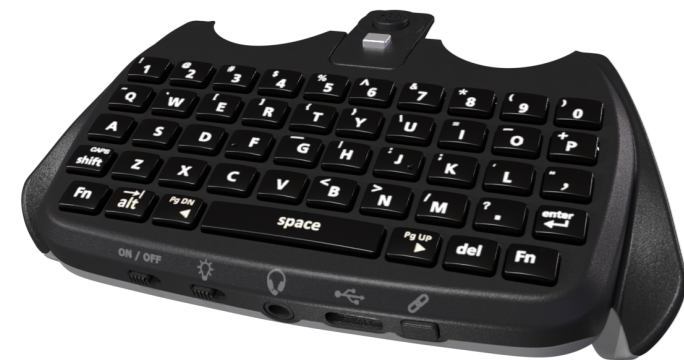
Quick Start Video Setup