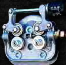
H/D 4 Roll Drive system