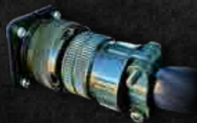
Military Spec Connectors