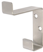
Z915.2-SSS Wire pattern hat and coat hook. Satin stainless steel.