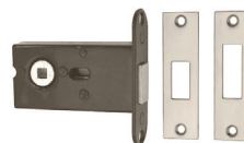
Z910 Mortice indicator bolt only. 5mm follower, 60mm backset. For use with Z904.4W-SSS & Z904.7W-SSS.