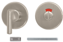
Z904.4W-SSS Bathroom turn and indicator set. Satin stainless steel. Concealed fixing roses, 53mm diameter x 4mm thick. RED/WHITE indicator on outside. Emergency release operated by coin or screwdriver. 5mm spindle for use with Z910 mortice indicator bolt. 8mm conversion sleeve for use with bathroom locks.