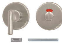
Z904.7W-SSS Bathroom turn and indicator set. Satin stainless steel. Concealed fixing roses, 53mm diameter x 7mm thick. RED/WHITE indicator on outside. Emergency release operated by coin or screwdriver. 5mm spindle for use with Z910 mortice indicator bolt. 8mm conversion sleeve for use with bathroom locks.