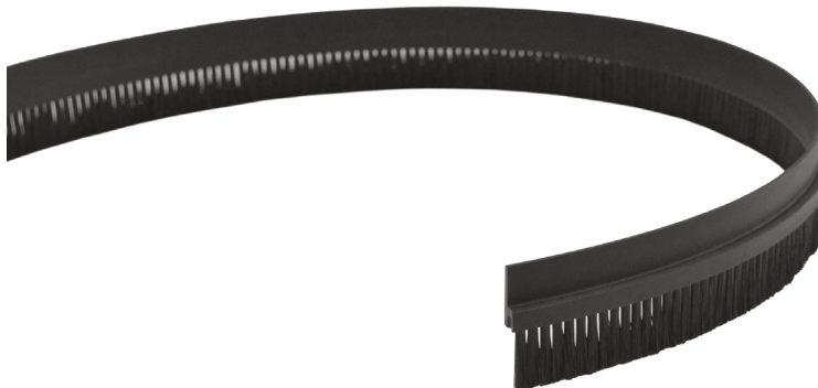
"H" PROFILE 180° STANDARD CARRIER