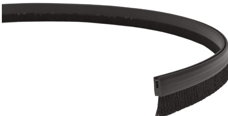
"C" PROFILE CLIP ON CARRIER