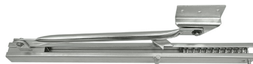
Reversible LH or RH