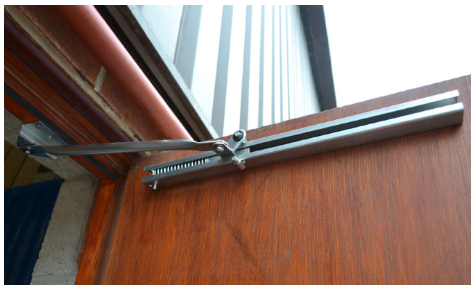
Clockwise closing (RH) illustrated

Z109.0Z and Z109.1Z are universal and suit both left hand and right hand doors. However the Z109.2Z is handed and you will need to specify whether the stay is to suit a clockwise closing or anti-clockwise closing door when ordering. See page 272 for handing chart. This door stay is available in three sizes to suit different door widths, but the smallest stay is also designed to work on standard width doors fitted with panic bolts. Since the channel is shorter it does not interfere with the panic bolt's vertical rods.