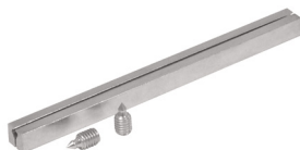
ZSC08 Two part split shaft spindle. 8 x 8 x 120mm. Zinc plated mild steel. Suits doors up to 54mm thick. Supplied with two grub screws to pierce spindle wall. (Box Qty 10)