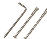
Z904.4BTF Bolt through fixing pack with hexagon shaft to suit 4mm and 7mm thick escutcheons, including two fixings and one allen key. (Box Qty 100)