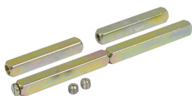
ZSC09 Split spindle. 8 x 8 x 120mm. Zinc plated mild steel. For use with split follower lock. Suits doors up to 54mm thick. Set includes 2 x 60mm parts and 2 x 50mm parts. (Box Qty 10)