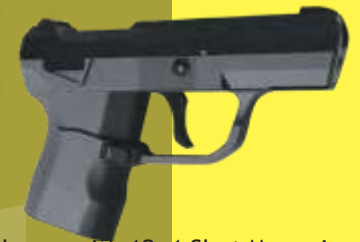
Shown with 12+1 Shot Magazine