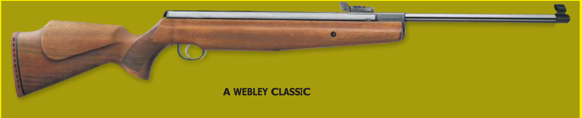
A WEBLEY CLASSIC