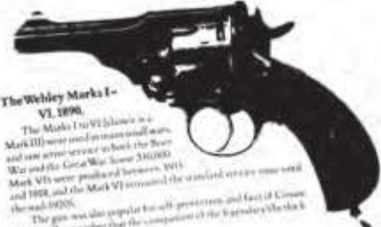
The Webley Marks I-VI Revolver, 1896.

It's a cap and ball muscle loader with a powerful compressed air trigger. It's a cap and ball muscle loader with a powerful compressed air trigger. It's a cap and ball muscle loader with a powerful compressed air trigger.