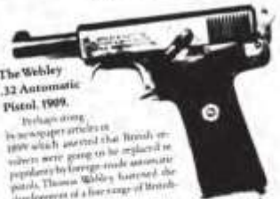
The Webley .32 Automatic Pistol, 1909.

This .442 and .400 calibre revolver was based on the famous R.I.C. model, and with a barrel only 2 1/2" long was designed purely as a short-range near support. It was produced in large quantities, and it gained a reputation for dependability throughout the world which it still holds, particularly in South America.