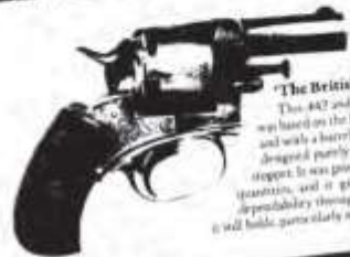
The British Bulldog, 1878.

It was a formidable weapon, and until the advent of the .44 and .46 Magnum, it possessed greater stopping power than any other hard gas. The fact probably accounted for its popularity. It was an age of small wars against local natives, at a time when the Adams and Foster .450s were the standard British service revolvers, and as many contemporary accounts noted, they simply weren't heavy enough to stop a charging war.