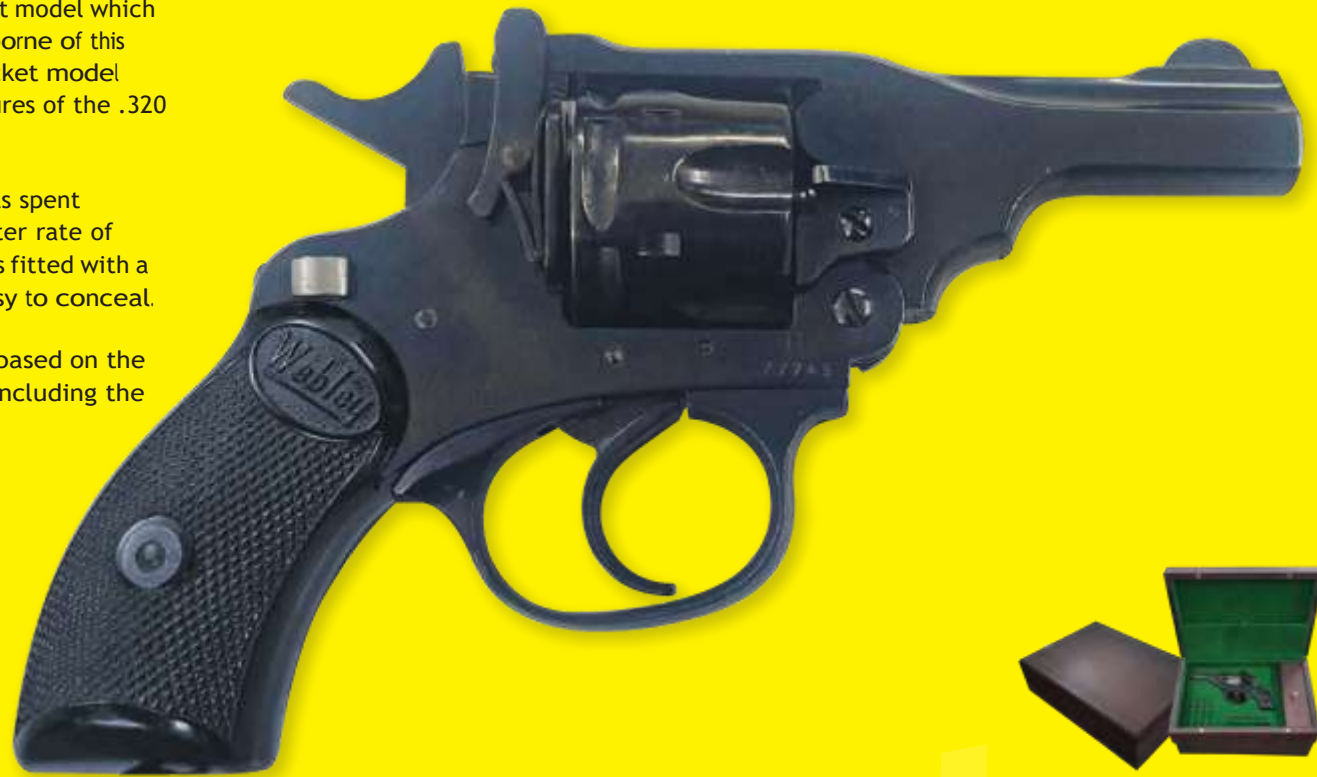
Supplied in Wooden Presentation Case

Now manufactured in India, the MKIV type C has been based on the draw original designs and has all the same great features including the famous Webley finish that has shown the test of time.