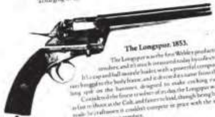
The Longspur, 1853.

The Peace-makers of the British Empire was the nickname the Army gave to the Webley-Green .430, 436 and .455 break-action, single-action-revolver. They were adopted by the Navy in 1887, and later by the Army as their standard service, and they're still considered to have the finest double action of any revolver made.