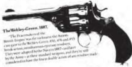
The Webley-Green, 1887.

It is a compact, well-organized design, simple and strongly constructed, and, although small, it's highly accurate.