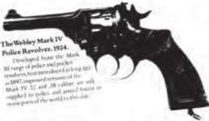
The Webley Mark IV Police Revolver, 1924.

The gun was also popular for self-protection, and fact of course, I think will remember that the companion of the legendary 'The Mark' Holmes, Dr. Watson, carried one.