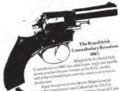
The Royal Irish Constabulary Revolver, 1867.

Adopted by the Royal Irish Constabulary in 1867, this solid frame, single and double action revolver became known as the R.I.C. model, and at the time would have cost the owner a few shillings.