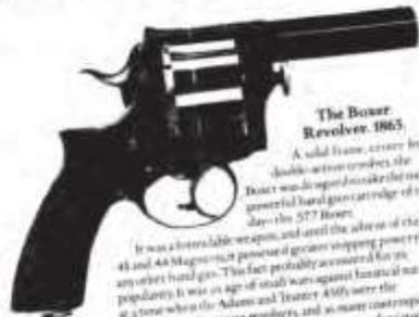
The Boxer Revolver, 1865.