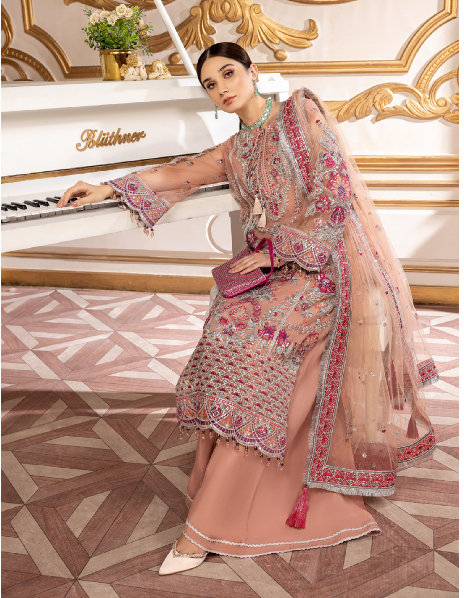
GRAPHITE GLEAM Design 07