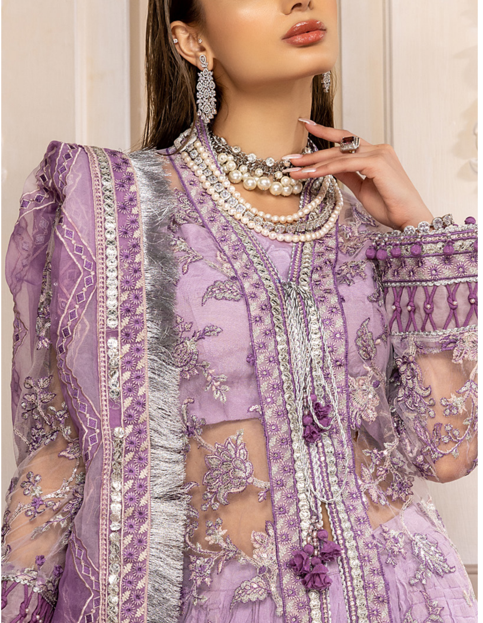
PURPLE HEART Design 10