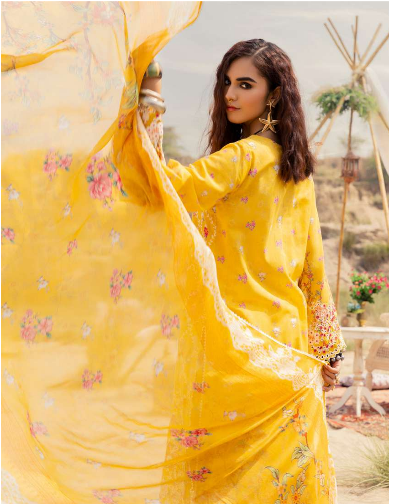
Long layers that drape on the body are the season's predominant silhouette, for the women who desire comfort and effortless looks to dominate their wardrobes.