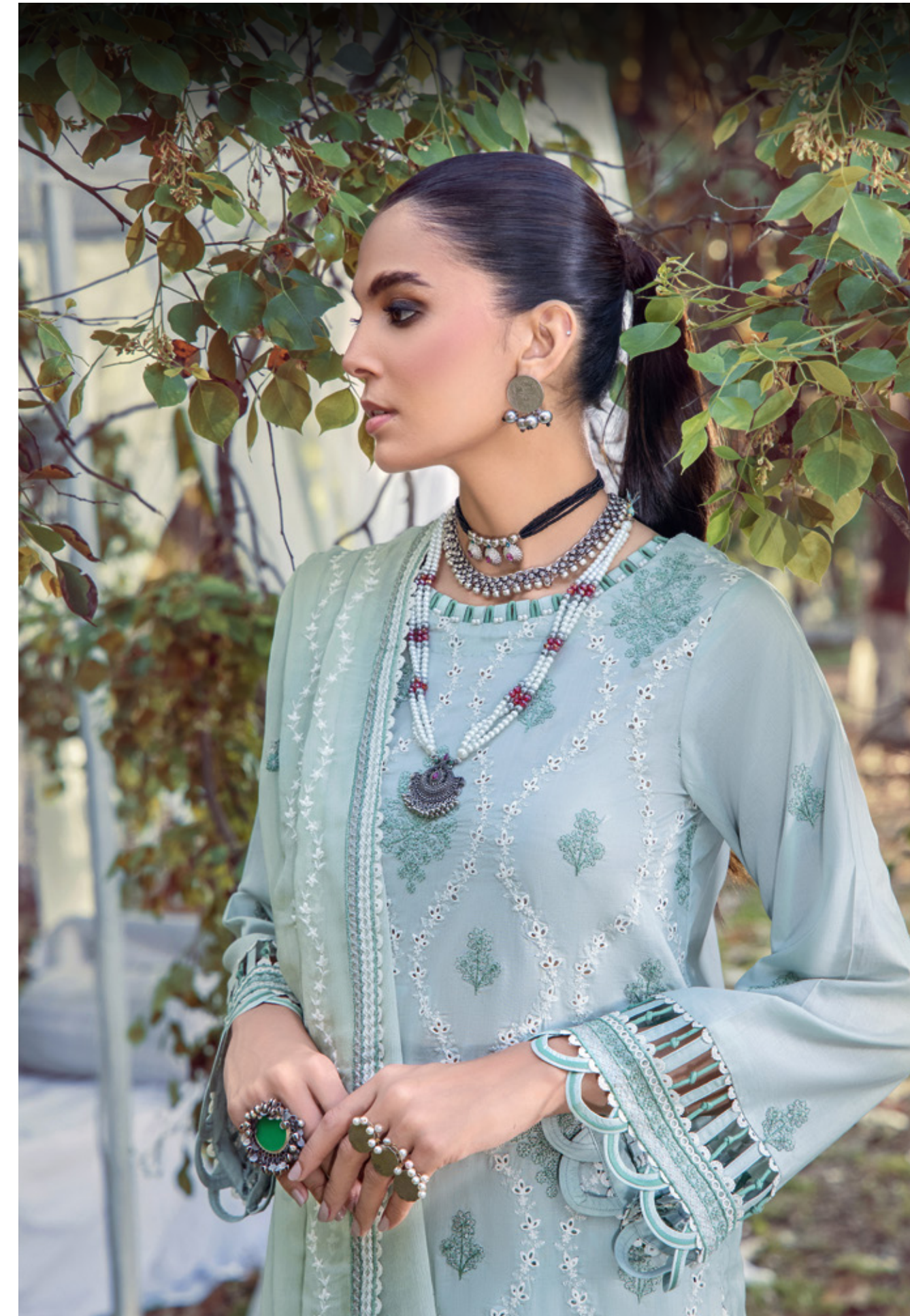
DESIGN - 08

Attires feature gracefulness and opulence which are simply irresistible and the final piece for your glamour jigsaw. It is time to transform your wardrobe into a dream world.