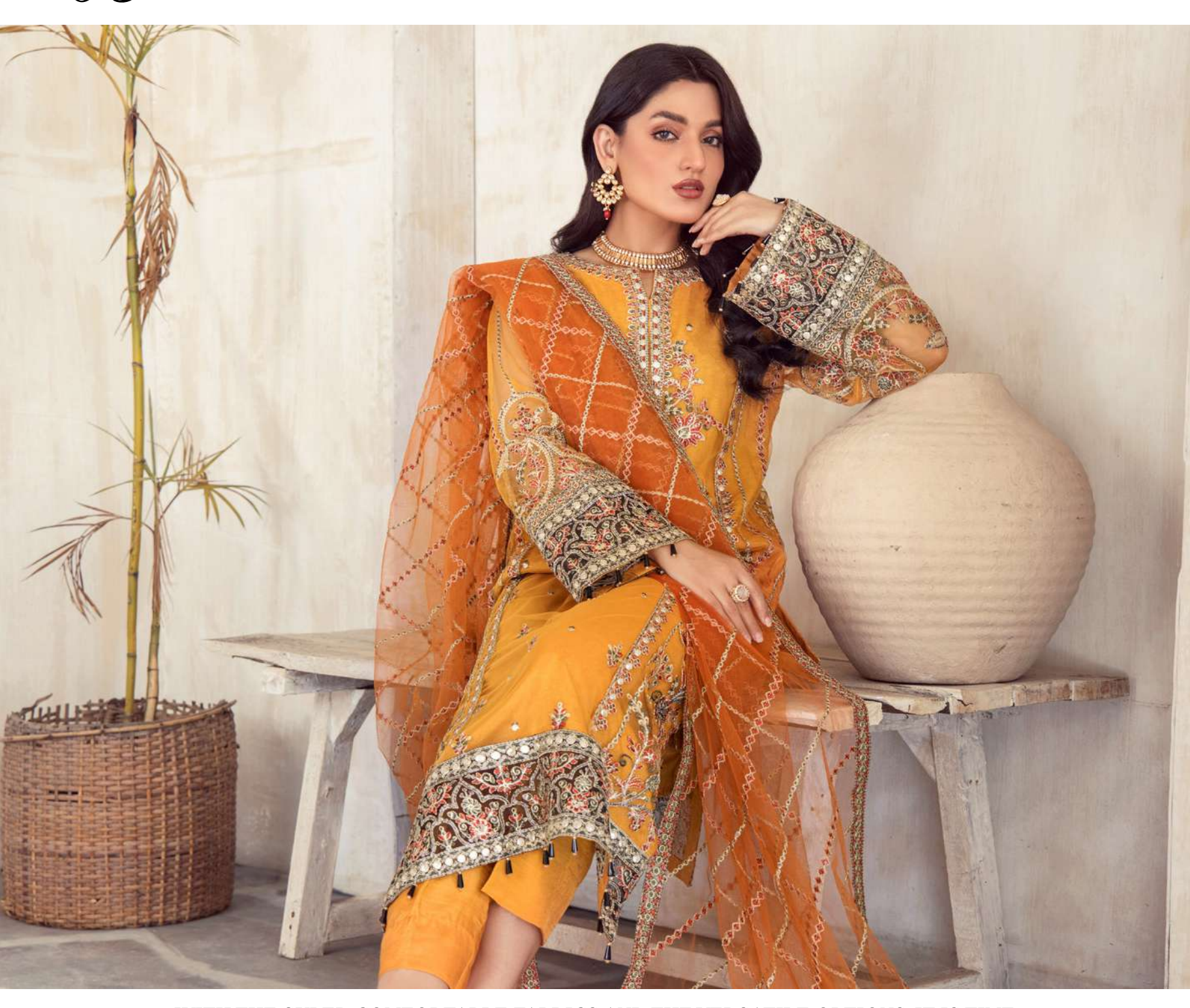
WITH THE SUPER COMFORTABLE FABRICS AND THE VERSATILE OPTIONS, IT IS TIME TO CELEBRATE THE ONSLAUGHT OF THE SEASONS WITH THE JOY OF APPEALS THAT WILL LOCK YOUR FASHION STATEMENT FOR THIS SEASON IN A FABULOUS WAY. SO, WHAT ARE YOU WAITING FOR? LET YOUR OUTFITS DO THE TALKING!