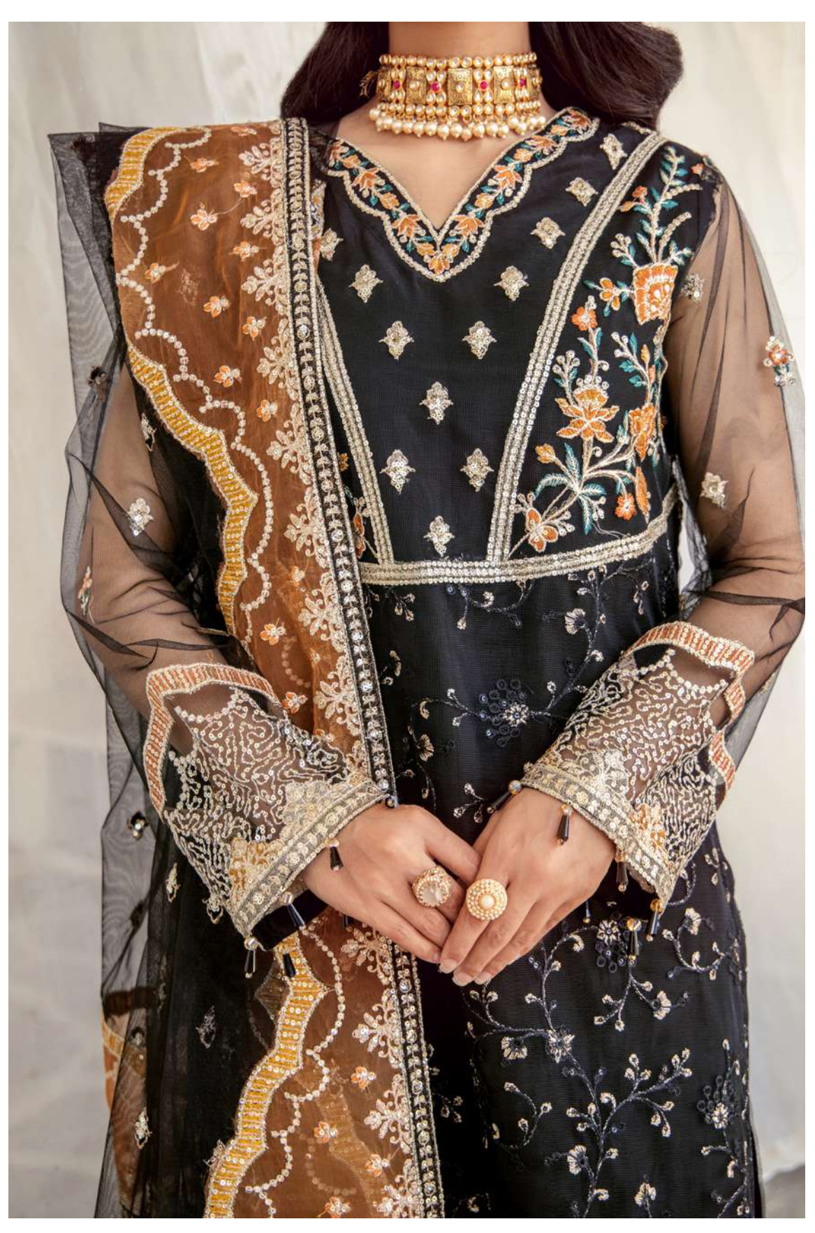
MAKE YOUR OWN STYLE STATEMENTS WITH INSPIRATIONS STRAIGHT FROM THE RUNWAY BROUGHT TO YOU BY OUR LATEST FASHION COLLECTION WHICH EMBRACES THE MOST UP TO DATE OPTIONS.