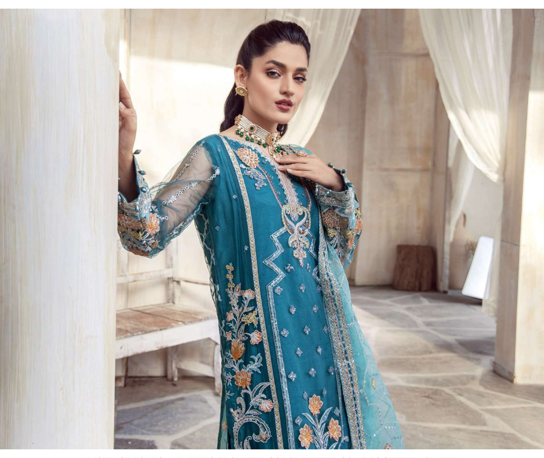
DISTINCT TONES AND TINTS FROM THE COLOR WHEEL COME TOGETHER ON THE FABRIC TO CREATE AN IMPRESSIVE TRIBAL IKAT DESIGN THAT IS TRENDING ALL OVER THE WORLD. WE MAKE THE STYLE ELEMENTS COME TOGETHER TO CREATE STATEMENT TRENDS FOR THE SEASON.