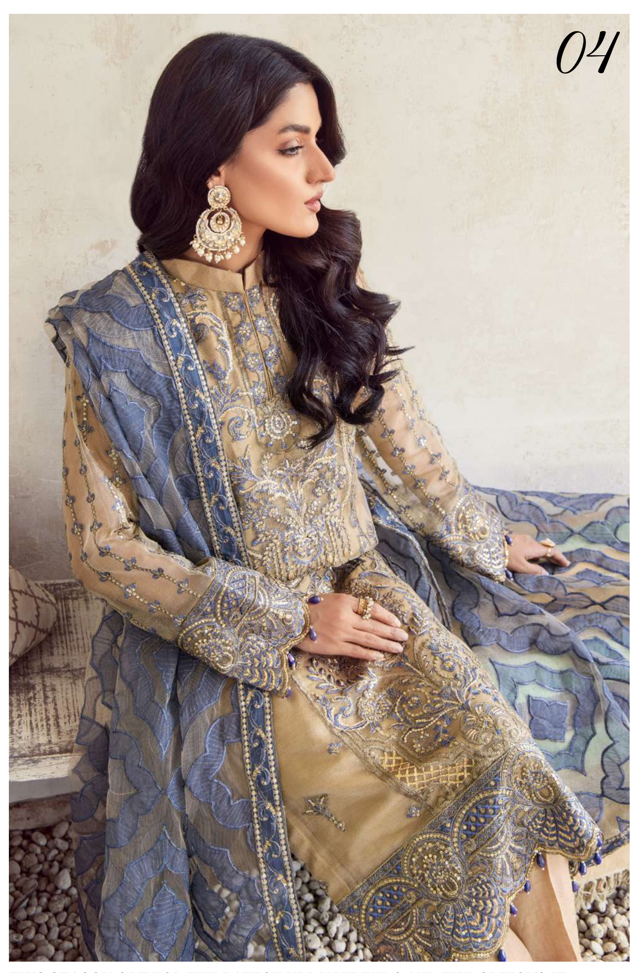
THIS SEASON OPT FOR THE LATEST URBAN TRENDS AND THE OPTIONS IT HAS TO OFFER AS IT IS NO SECRET THAT THEIR COOLLY SOPHISTICATED CLOTHES HAVE NOT STOPPED TURNING HEADS SINCE EVER.