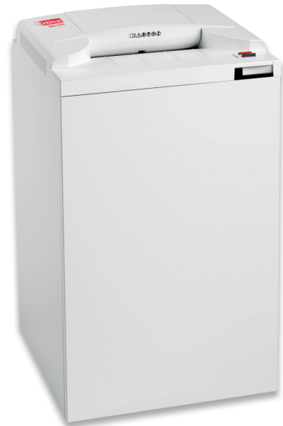
W/D/H 49 x 44 x 90 cm