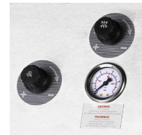
STEAM AND DEGREASER VOLUME CONTROL