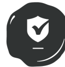
BOILER TANK LIFETIME WARRANTY